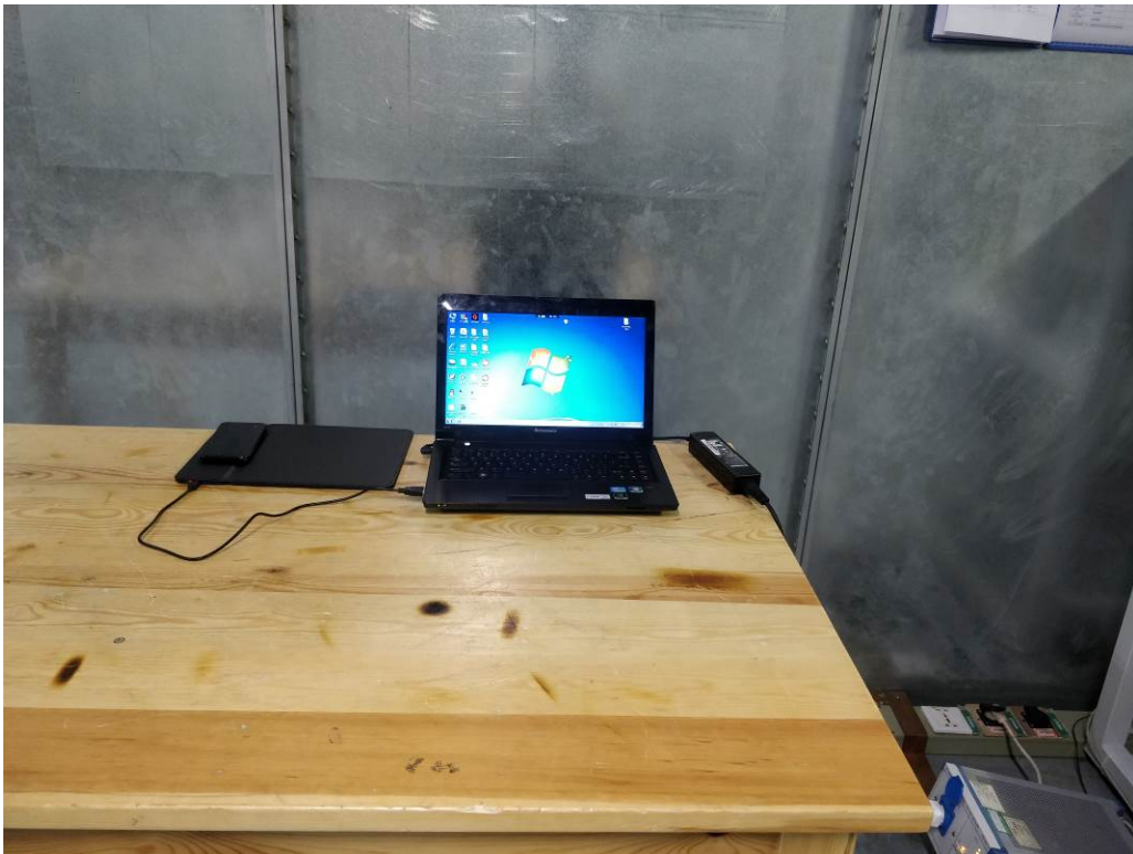
Conducted Emission-PC charge mode