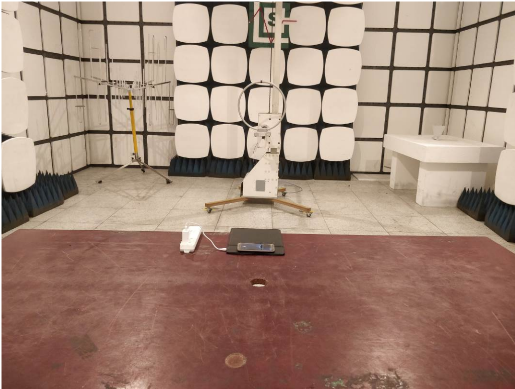
Radiated Emission below 30MHz-AC adapter charge mode