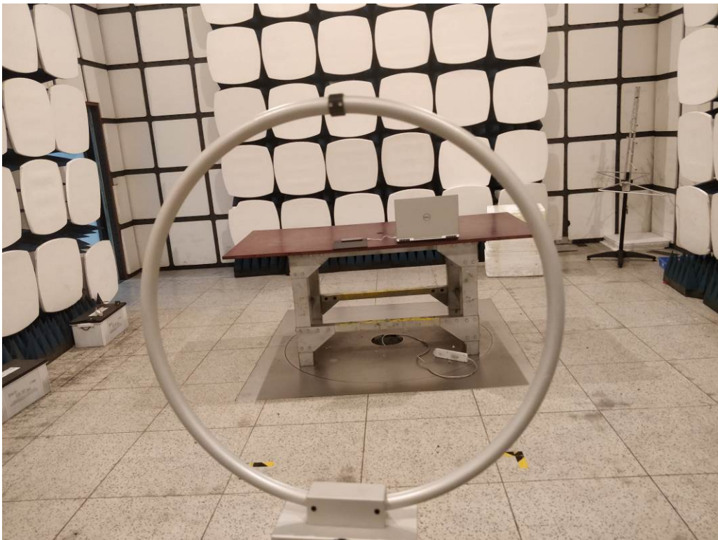
Radiated Emission below 30MHz-PC charge mode