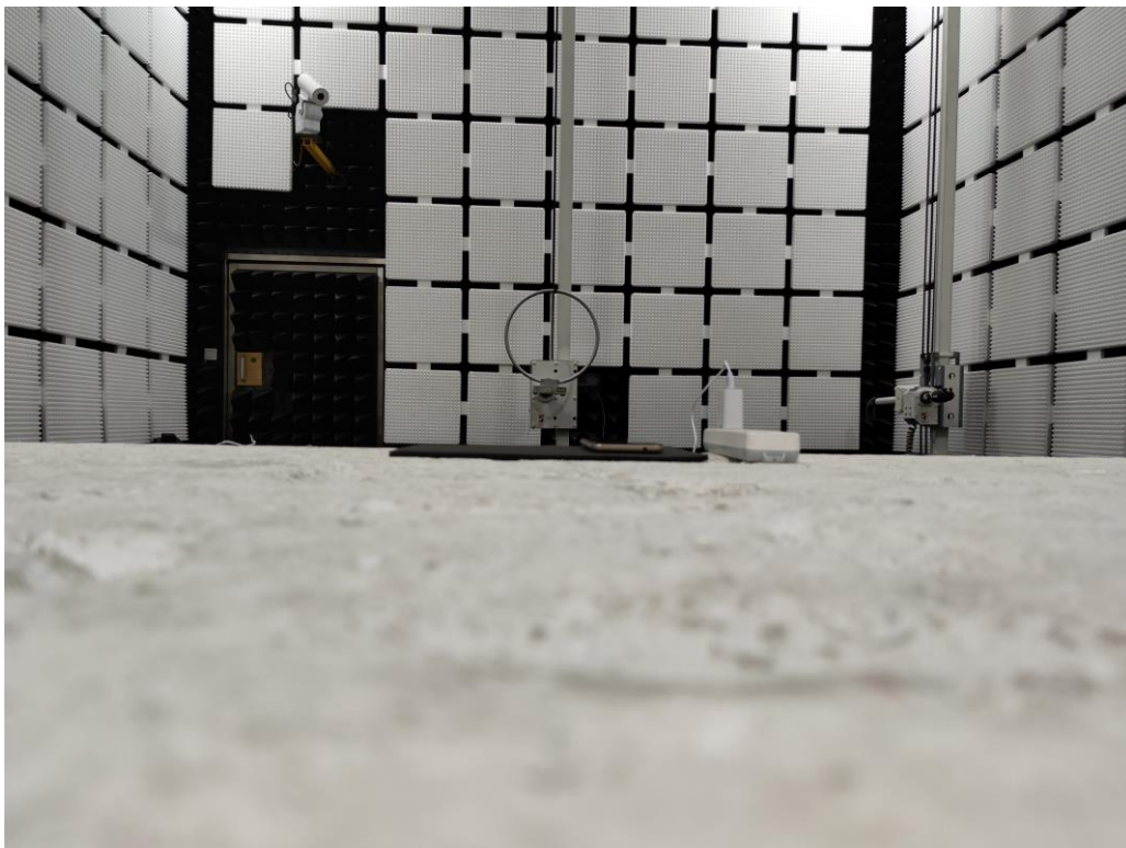
Radiated Emission below 30MHz