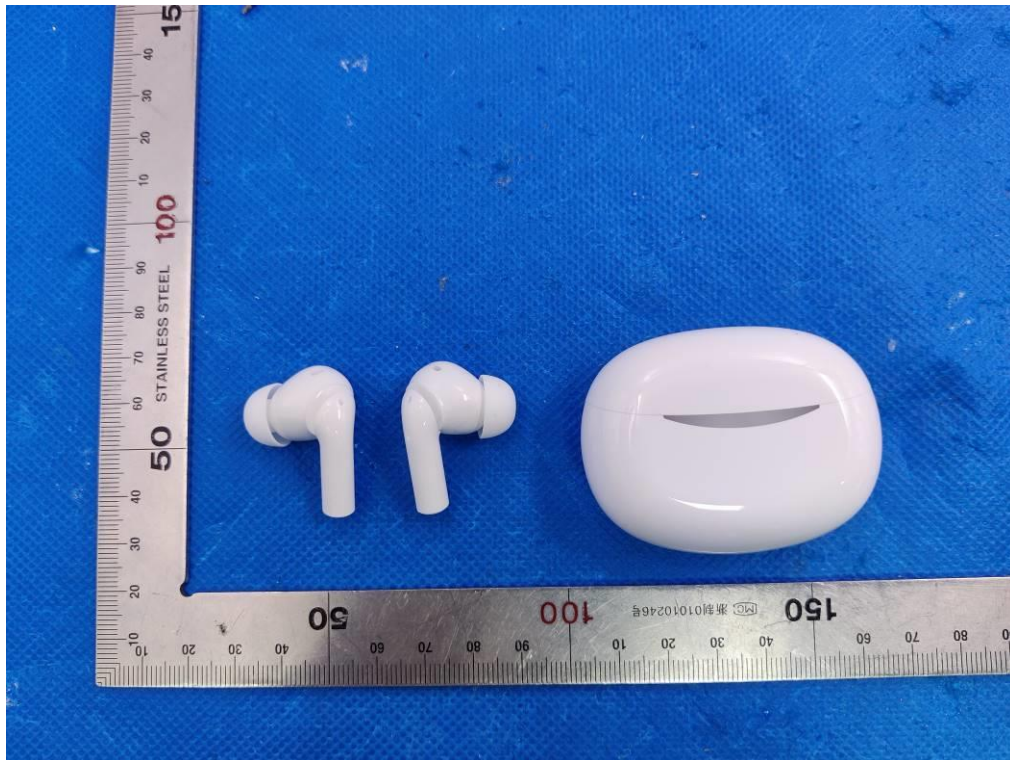
TOP VIEW OF EUT