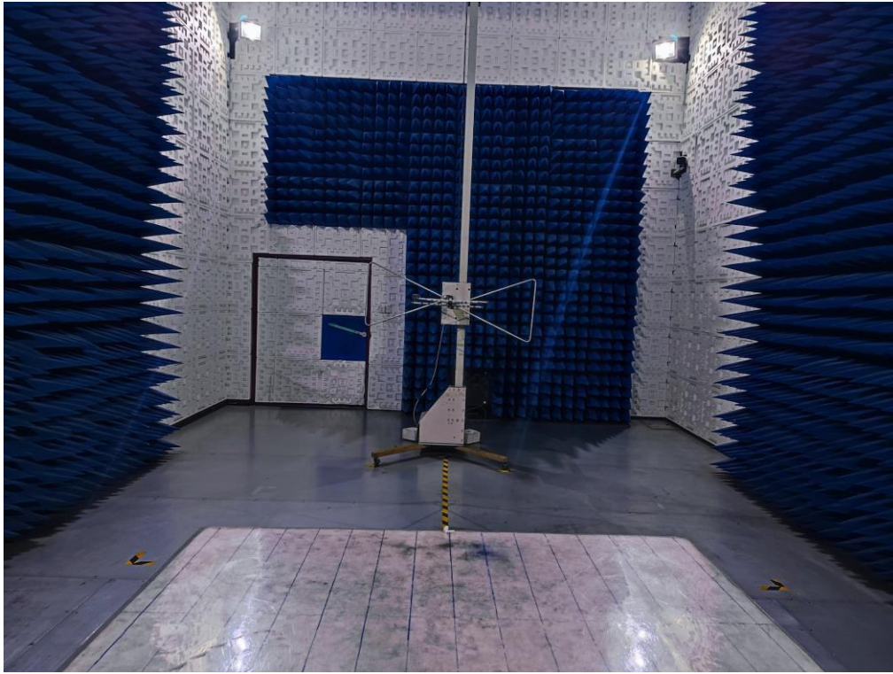
RADIATED EMISSION TEST SETUP ABOVE 1GHz