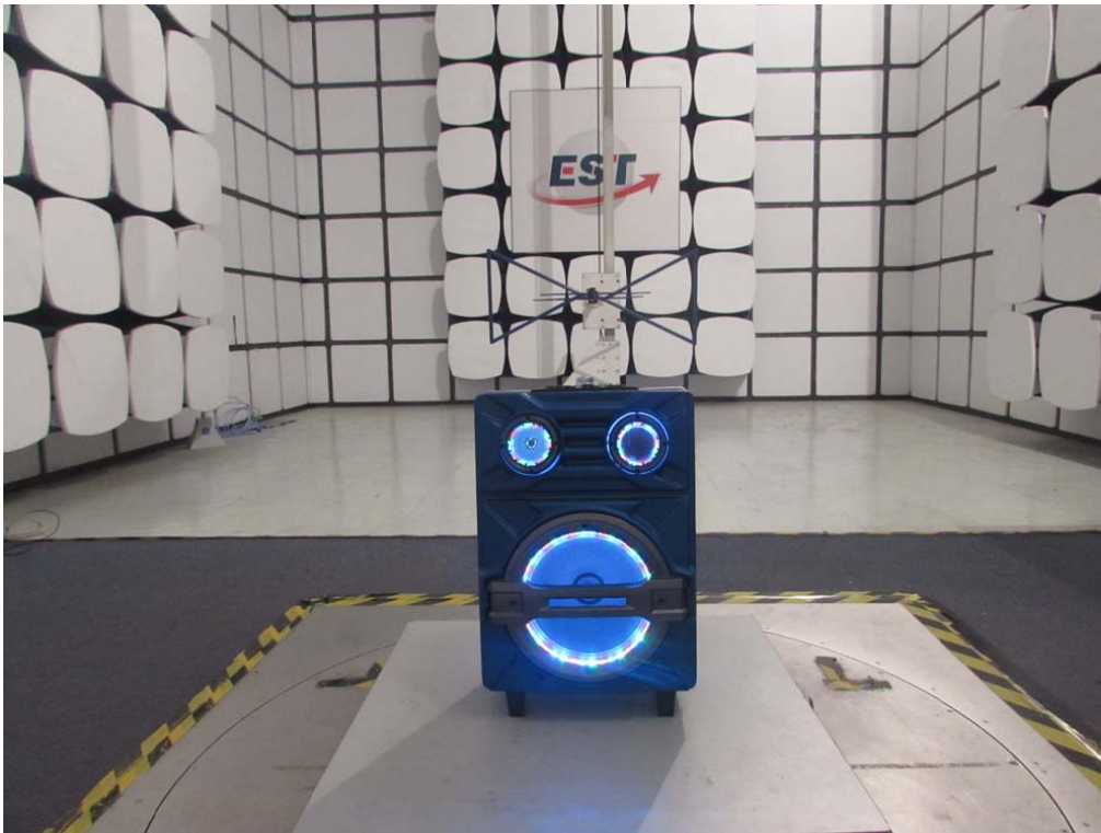
Radiated Test (1000-25000 MHz)