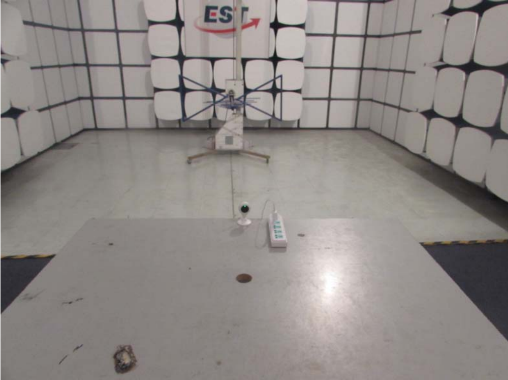
Radiated Test (1000-25000 MHz)