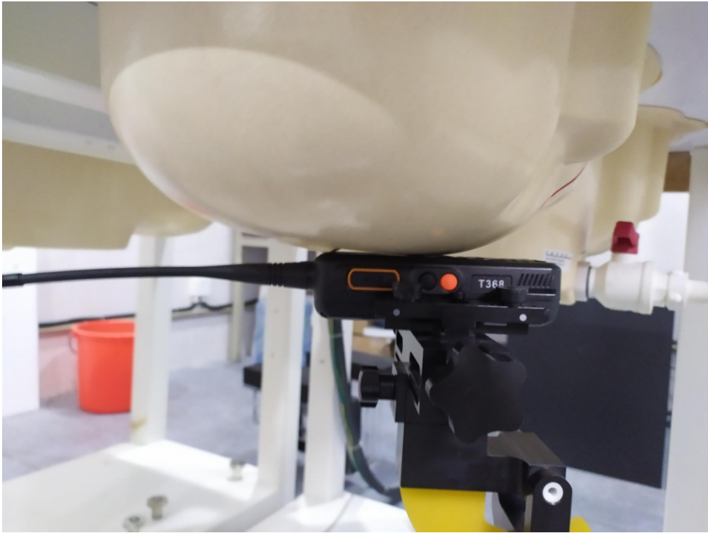
Right Tilt Setup Photo