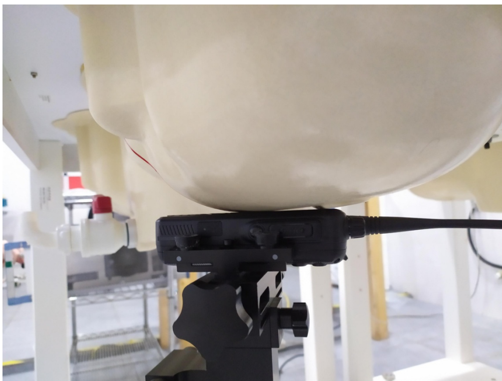
Left Tilt Setup Photo