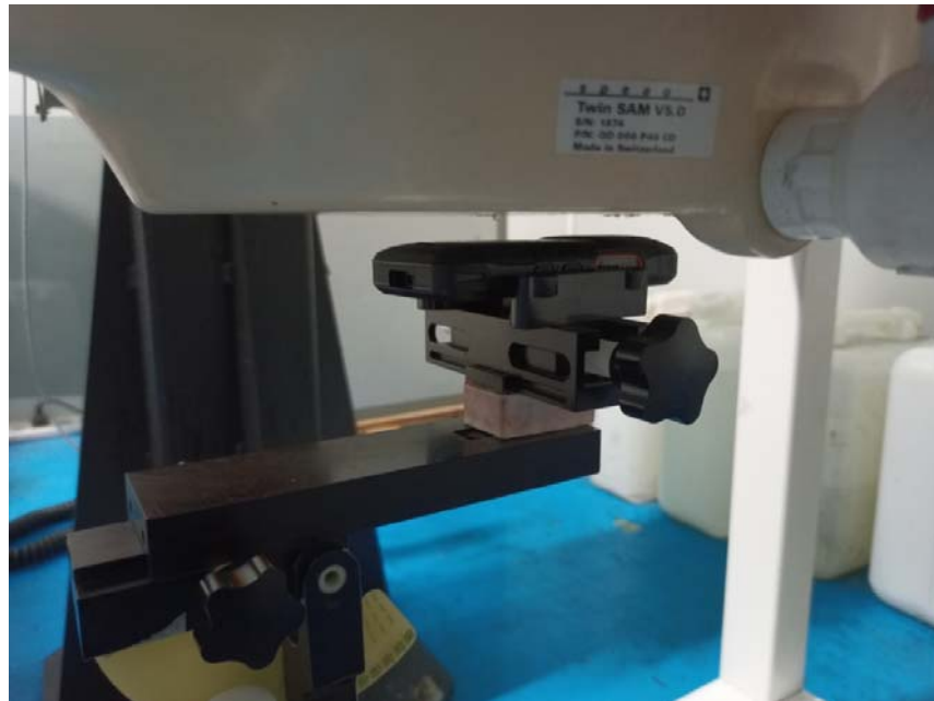
Body (Worn) Front Setup Photo (5mm)