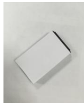
2. Li-ion Battery pack (1 Pcs)