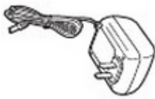
4. Adaptor (1Pcs)