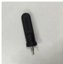
1. Antenna (1 Pcs)