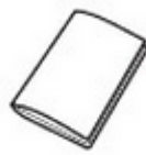
5. Manual Book (1 Pcs)