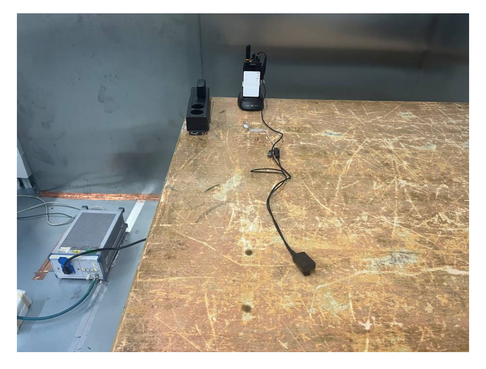
EXHIBIT D - TEST SETUP PHOTOGRAPHS