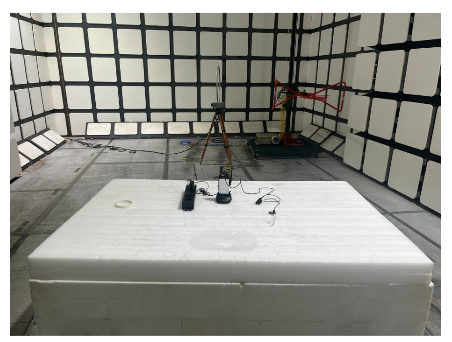
Radiated Emissions View (Below 30MHz) Perpendicular