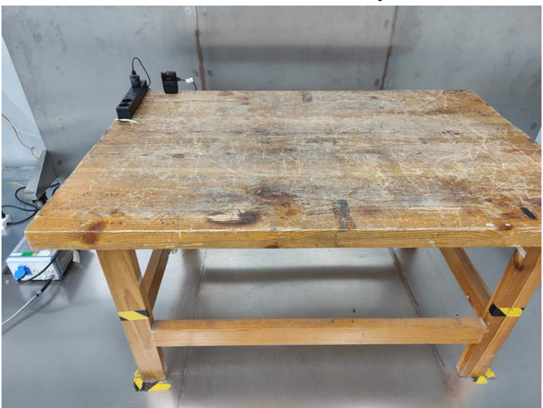
Conducted Emissions Side View_Adapter