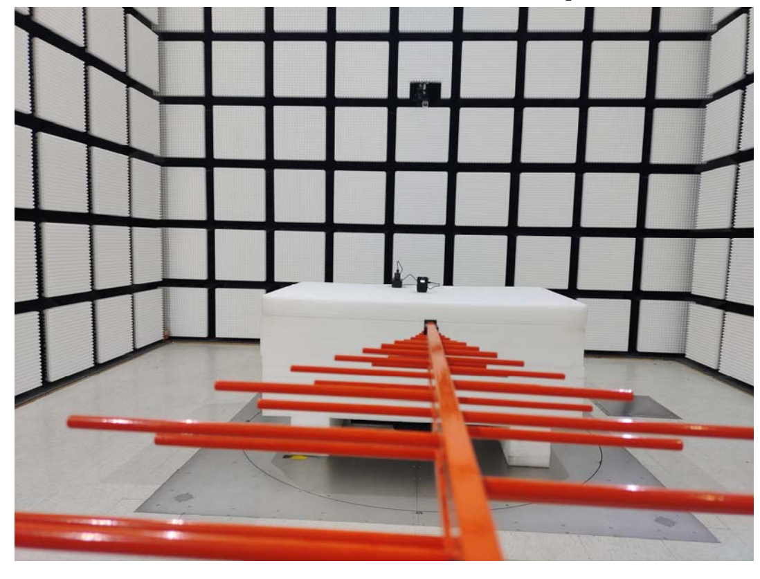
Page 3 of 4