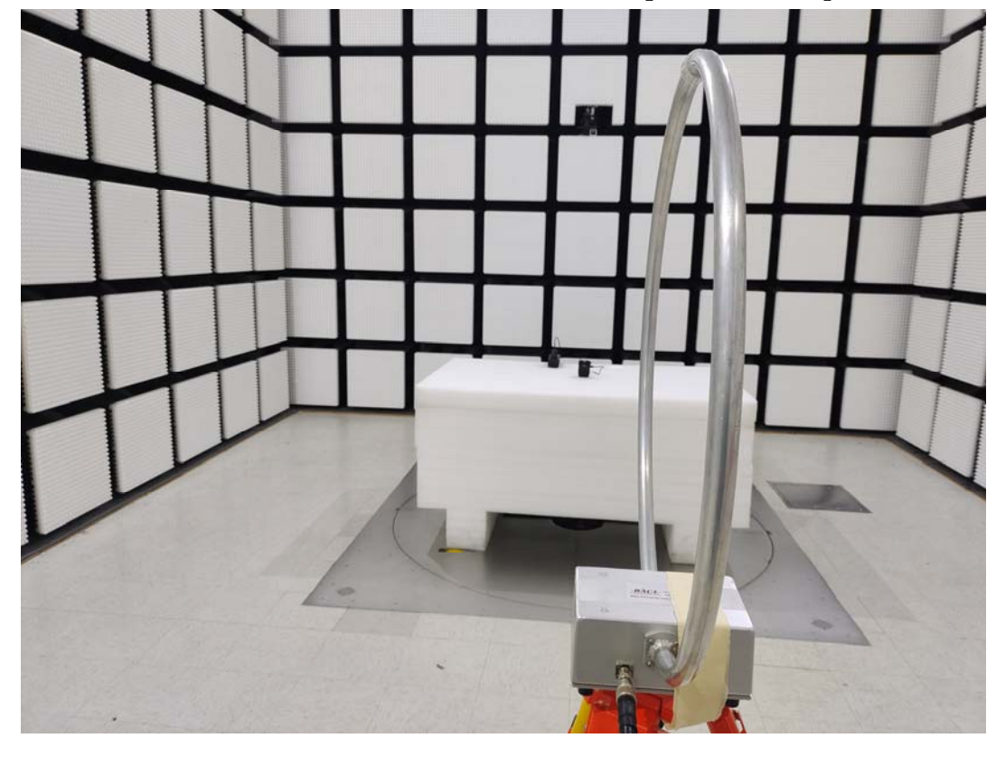
Page 2 of 4