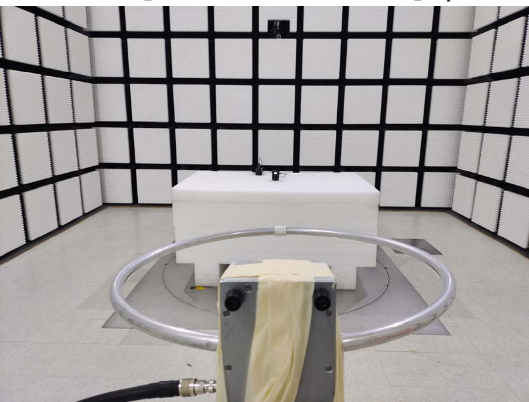
30MHz~1GHz _ Radiated Emission View _Adapter