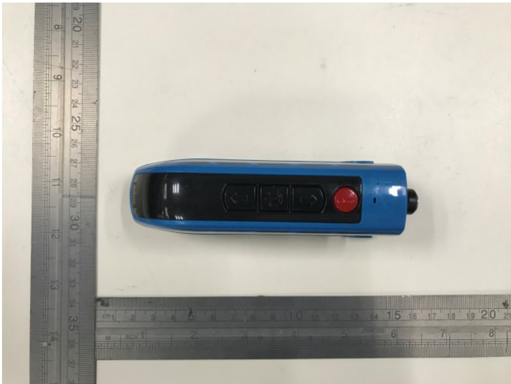
External View (Model: 3971)