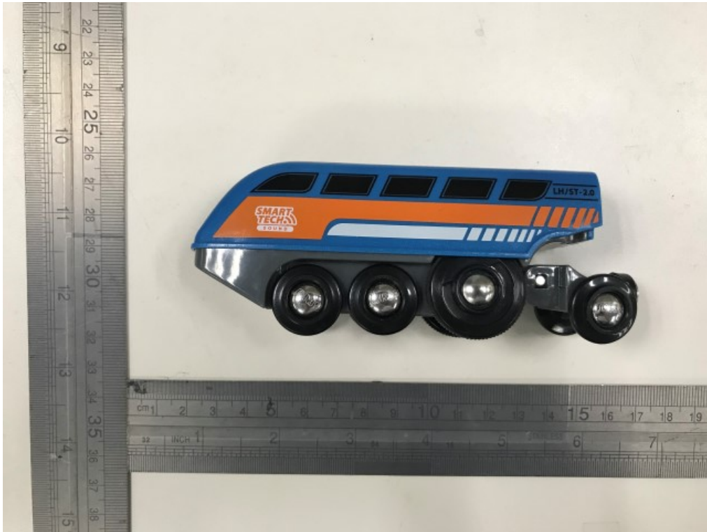
External View (Model: 3971)