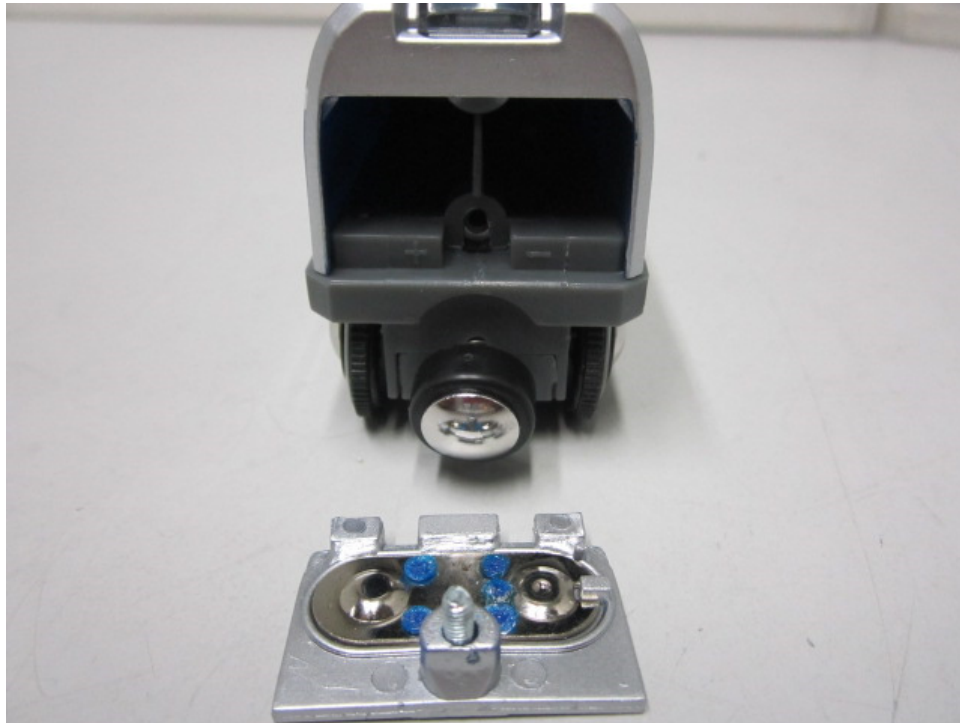
External View (Model: 33863)