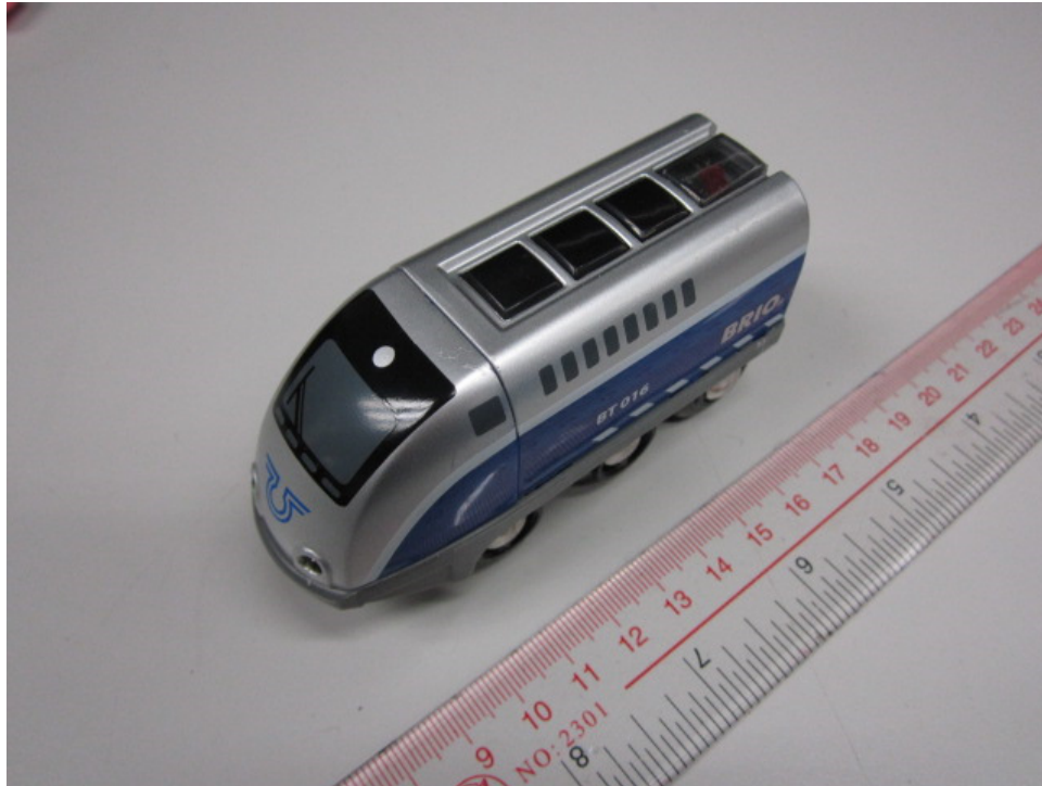
External View (Model: 33863)