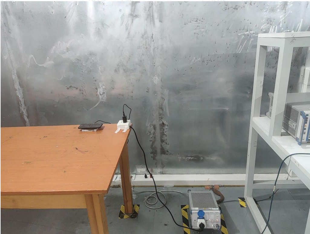
Conducted Emission-AC adapter charge mode