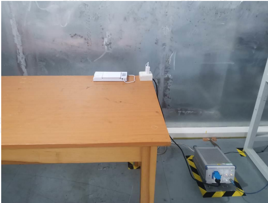
Photo of Power Line Conducted Measurement