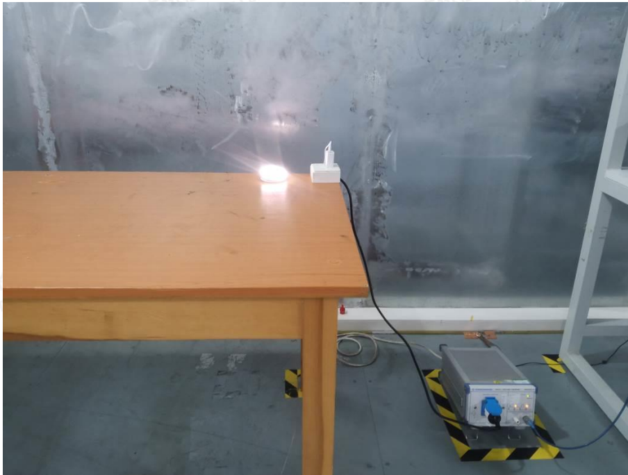
Photo of Power Line Conducted Measurement