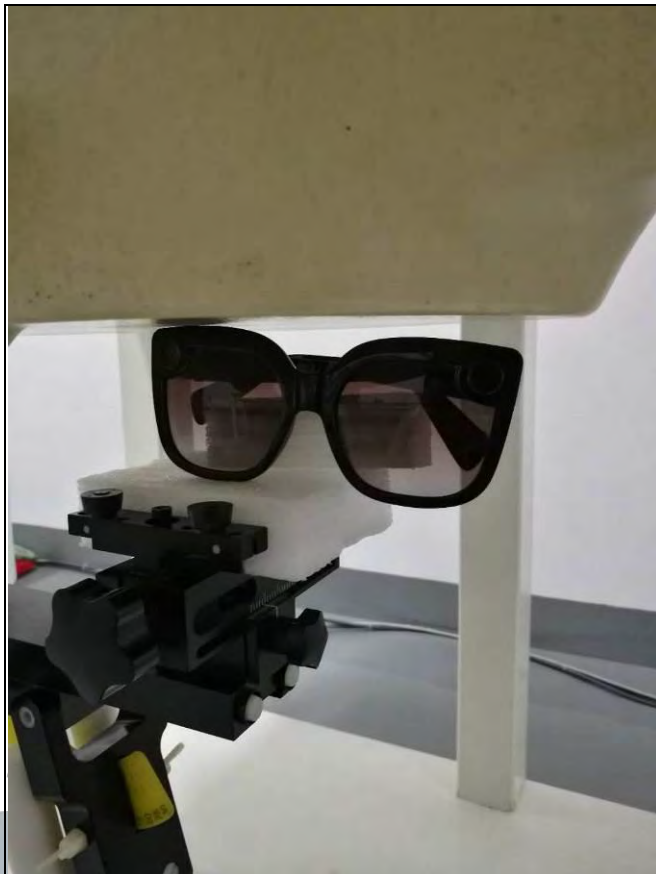
Top Side of EUT with 0 cm Gap