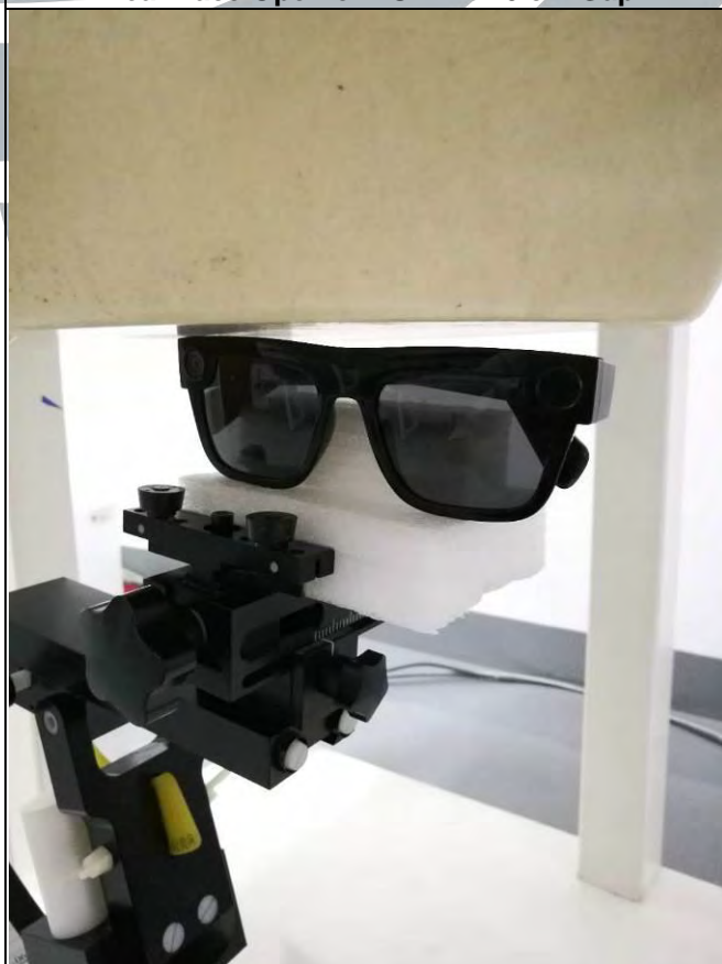
Top Side of EUT with 0 cm Gap