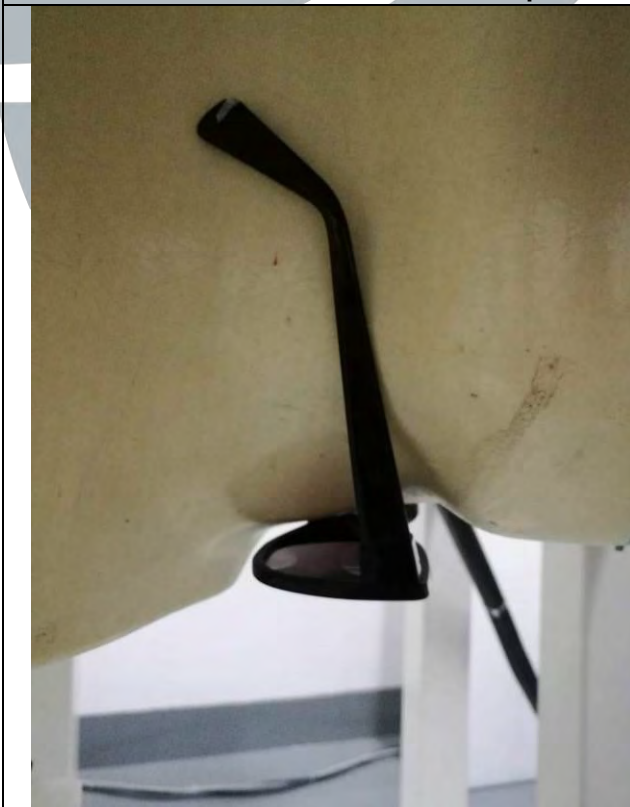
Rear Face Open of EUT with 0 cm Gap