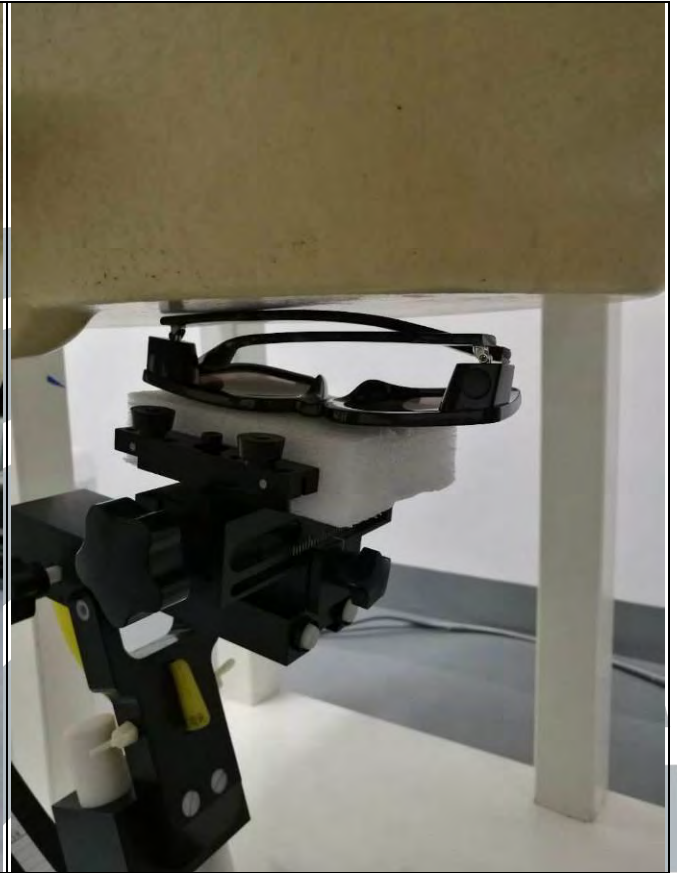
Rear Face Close of EUT with 0 cm Gap