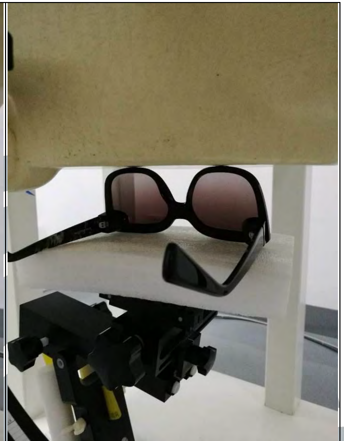
Bottom Side of EUT with 0 cm Gap