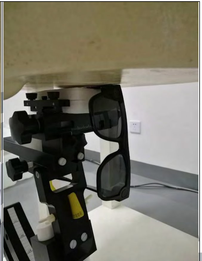
Right Side of EUT with 0 cm Gap