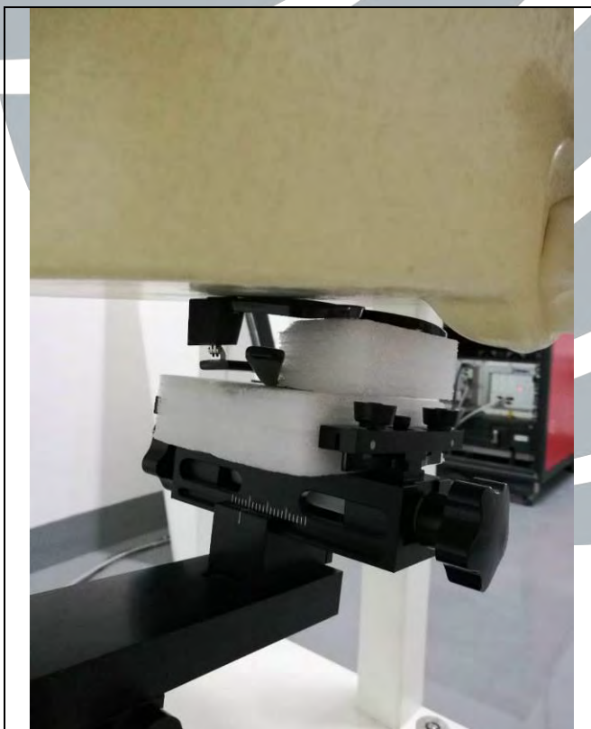
Front Face of EUT with 0 cm Gap