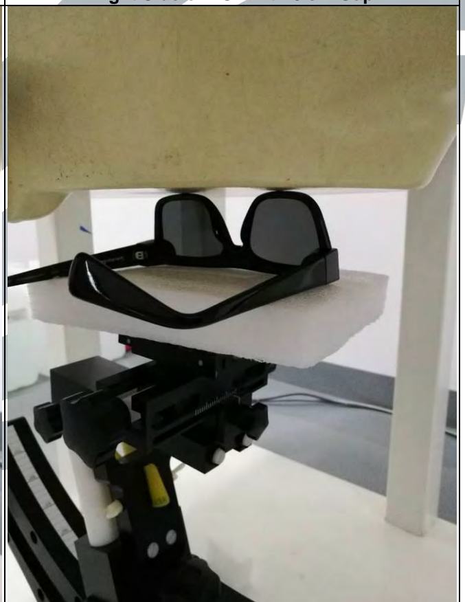
Bottom Side of EUT with 0 cm Gap