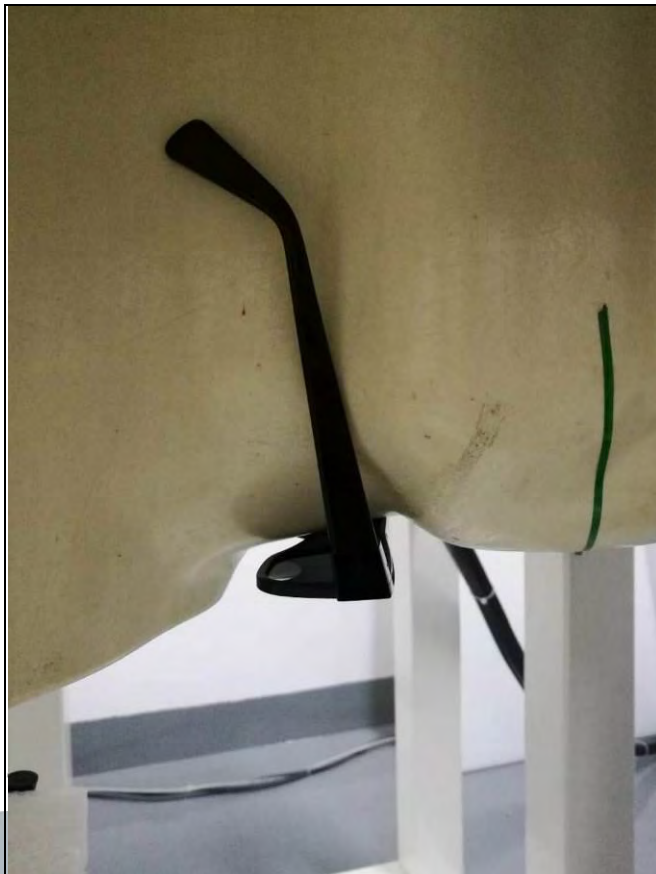
Rear Face Open of EUT with 0 cm Gap