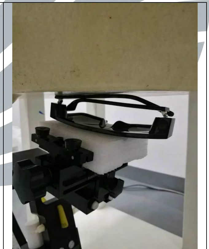
Rear Face Close of EUT with 0 cm Gap