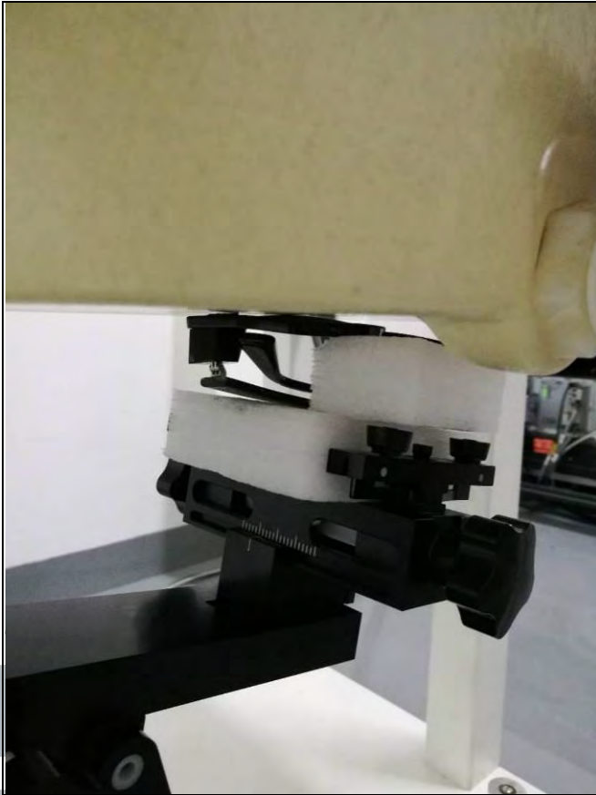
Front Face of EUT with 0 cm Gap