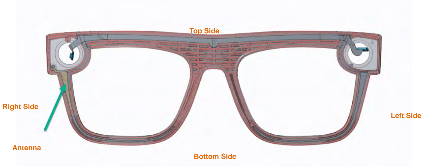
<EUT Front View>

The separation distance for antenna to edge: