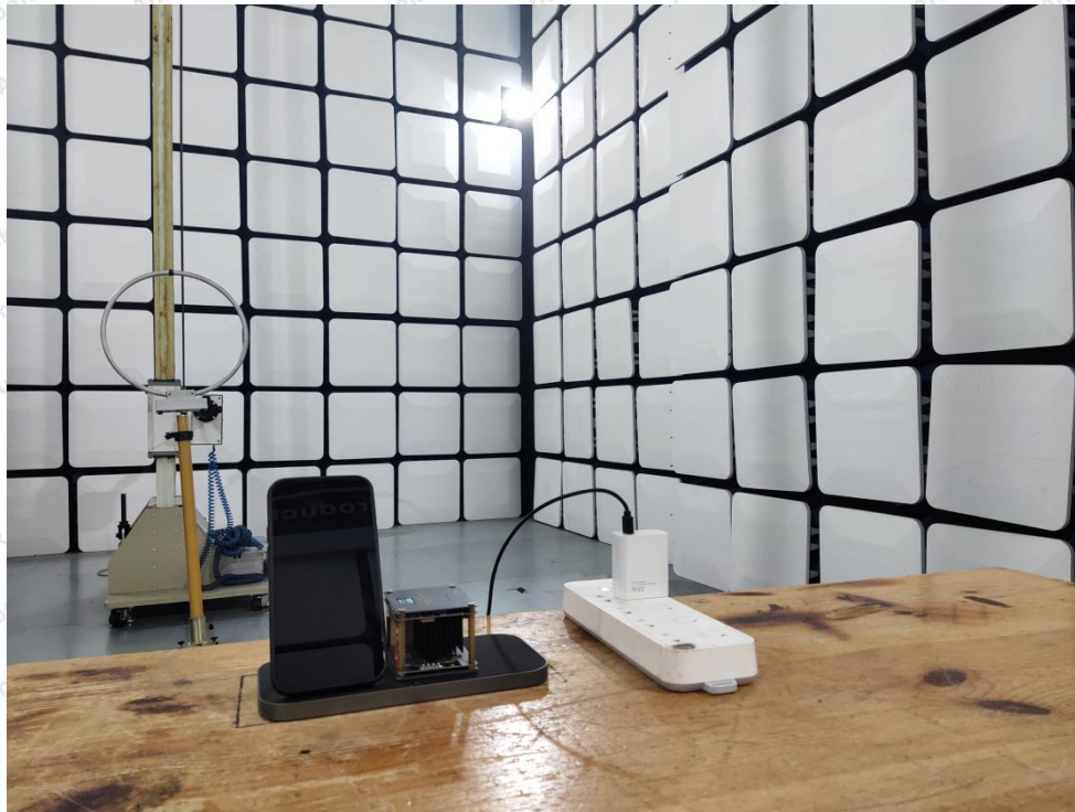
Photo of MPE Measurement