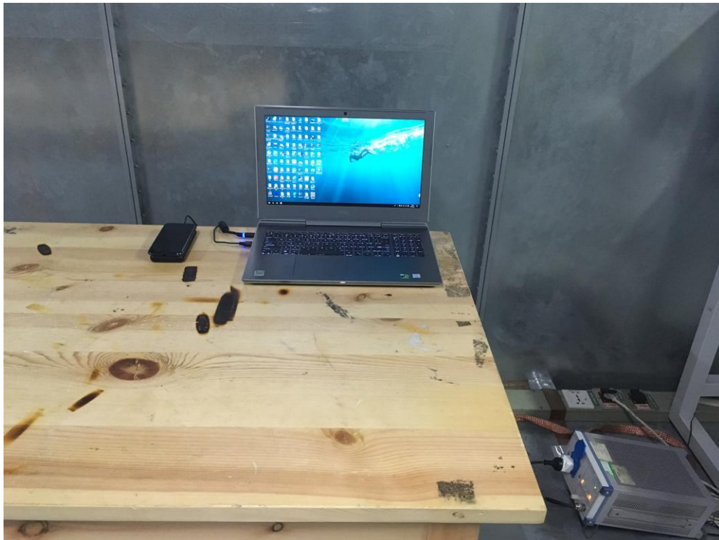
Conducted Emission-PC charge mode