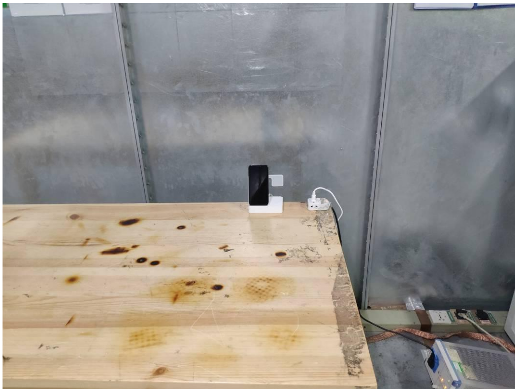
Conducted Emission-AC charge mode