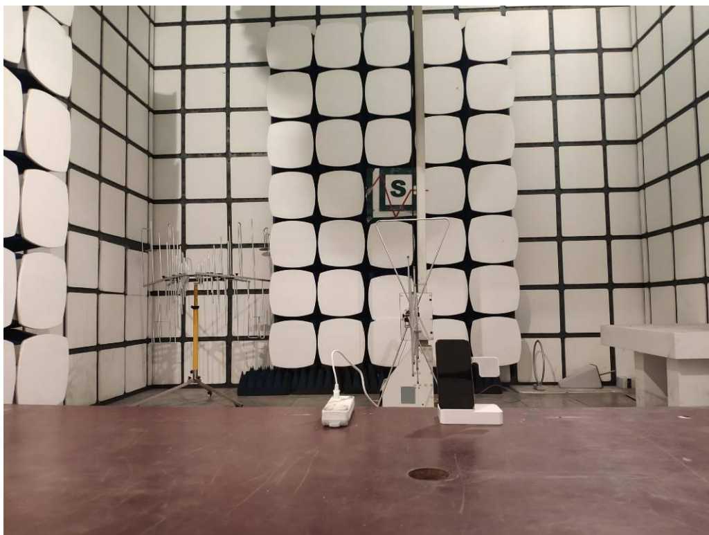
Radiated Emission below 1GHz-AC charge mode