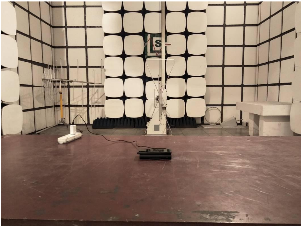
Radiated Emission below 1GHz-AC adapter charge mode