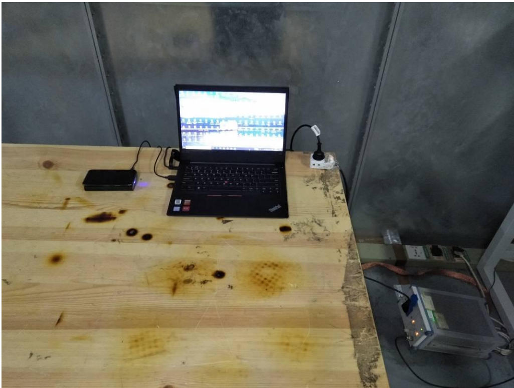
Conducted Emission-PC charge mode