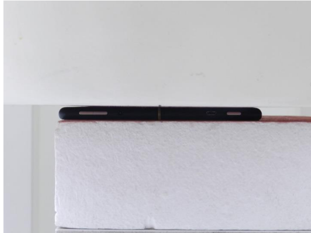
Bottom Face, Test Separation 0 mm