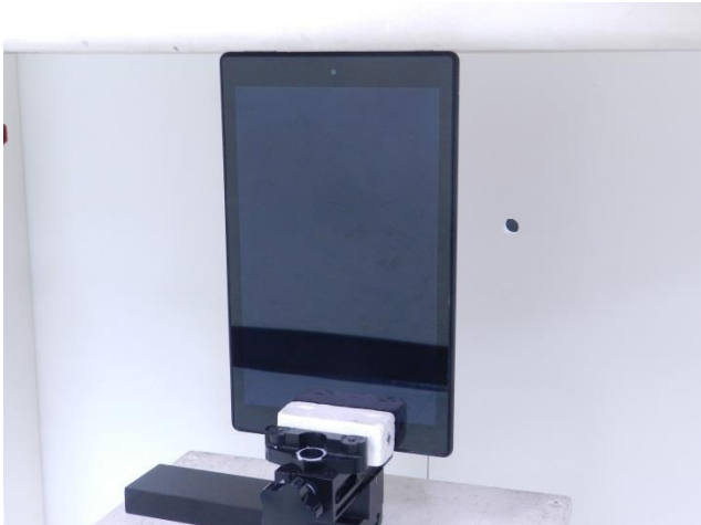
Edge1, Test Separation 0 mm