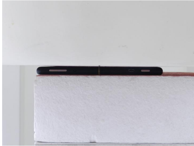
Bottom Face, Test Separation 0 mm