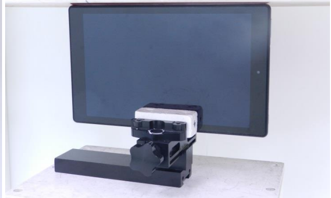
Edge4, Test Separation 0 mm