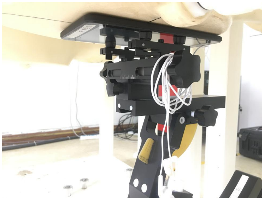
Body worn _ Back With Headset

(Test distance: 0mm, Thickness of DUT: 9mm)