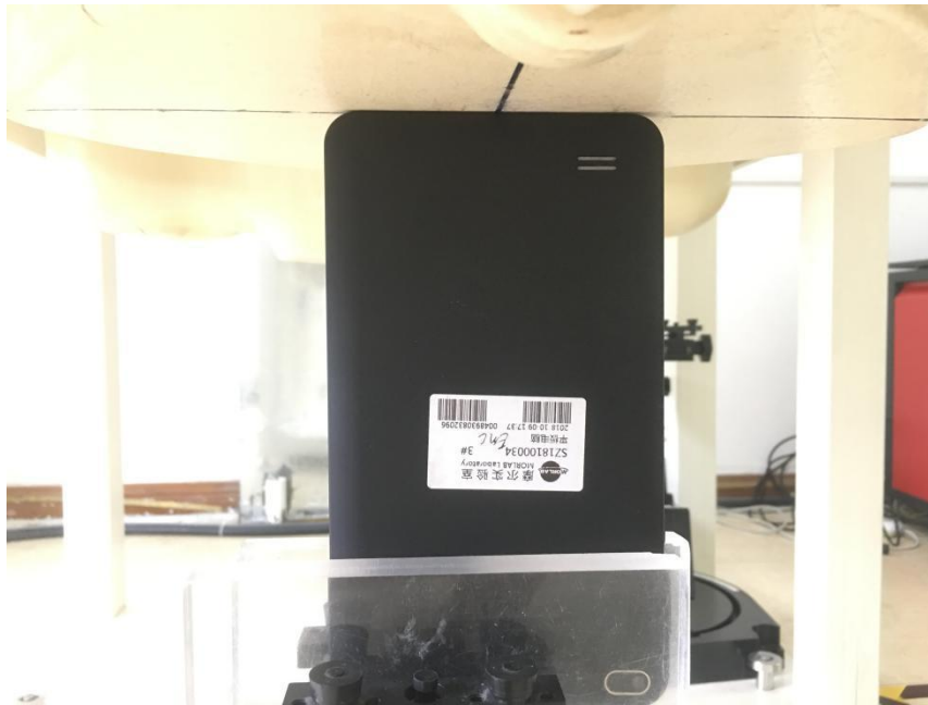
Body worn _ Bottom (Test distance: 0mm, Thickness of DUT: 9mm)