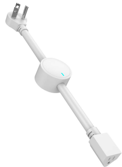
Smart Switch User Manual HKZW-SW02U

Smart Switch is a Z-Wave Switch module specifically used to enable Z-Wave command and control (on/off) of any plug-in tool. It can report wattage consumption or kWh energy usage. Smart Switch is also a security Z-Wave device and supports the Over The Air (OTA) feature for the product's firmware upgrade.