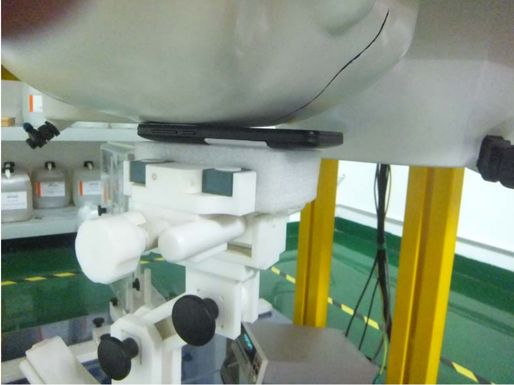
Right Head Tilt View