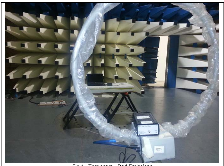
Fig 1 Test setup Rad Emissions