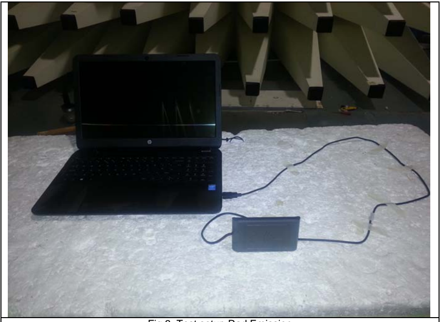
Fig 3 Test setup Rad Emission