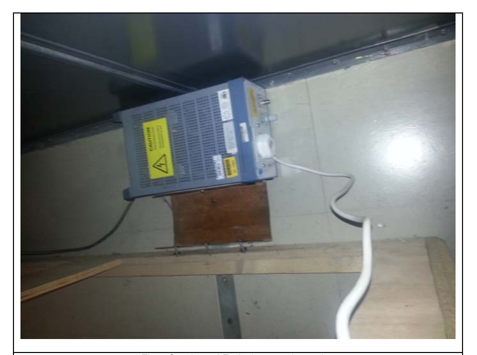
Fig 4 Conducted Emissions on the mains