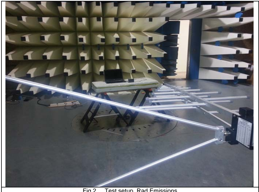
Test setup Rad Emissions