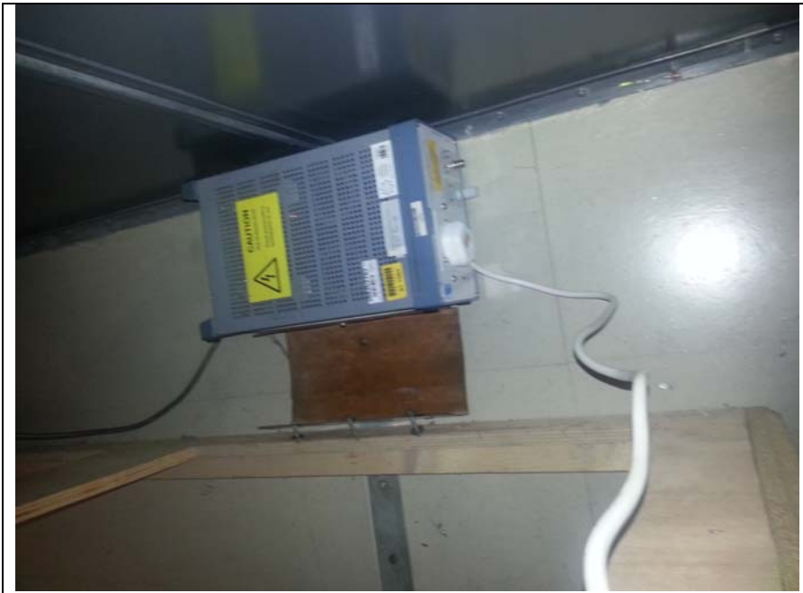
Fig 5 Conducted Emissions on the mains