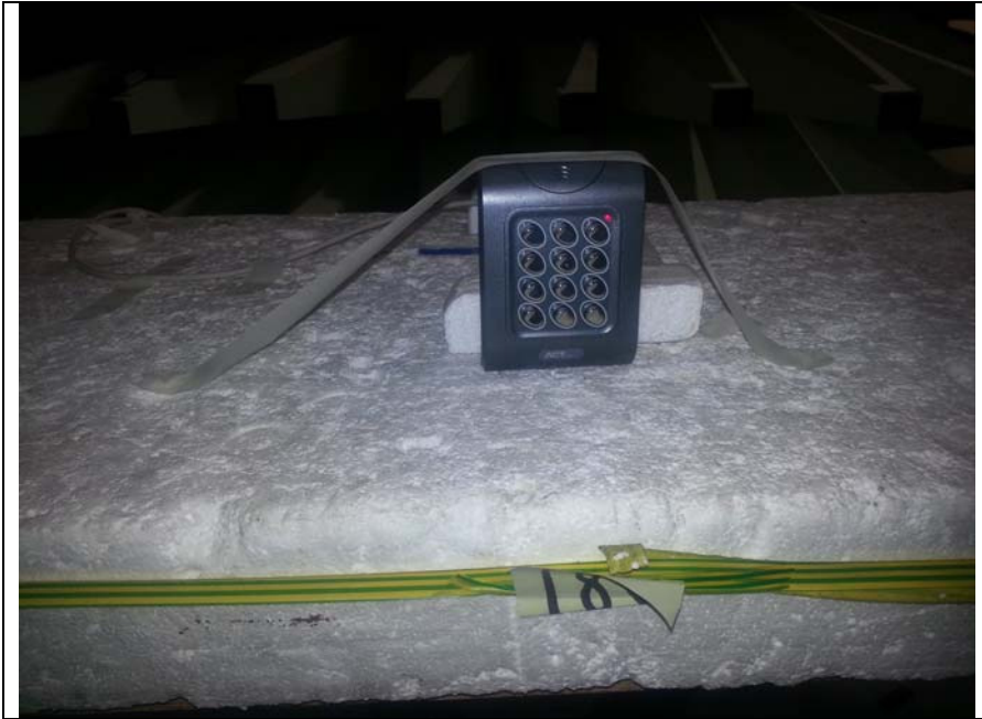
Fig 3 Test setup Rad Emission