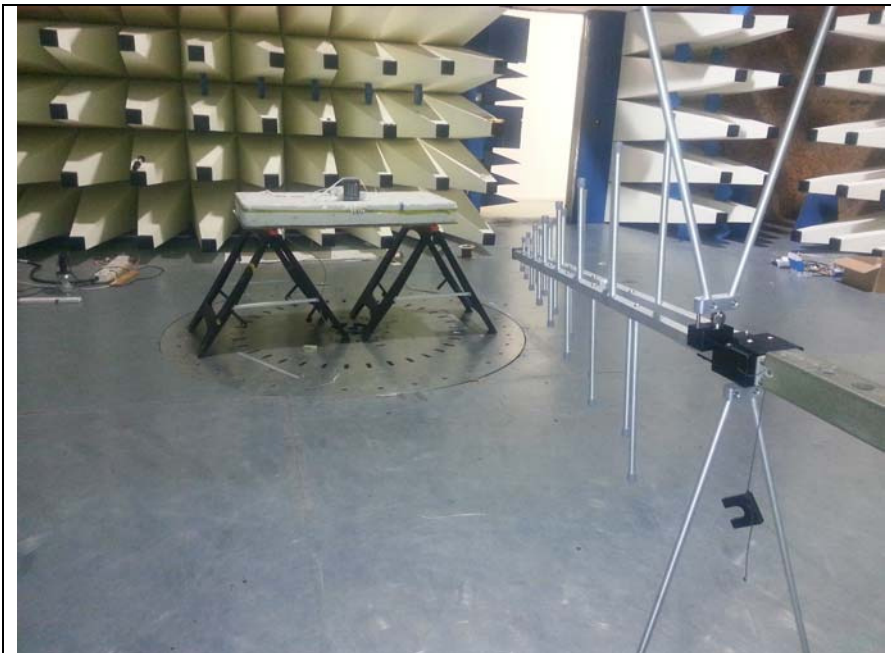
Fig 2 Test setup Rad Emissions