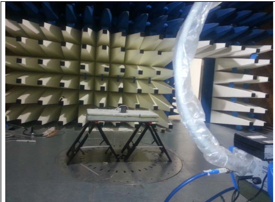
Fig 1 Test setup Rad Emissions