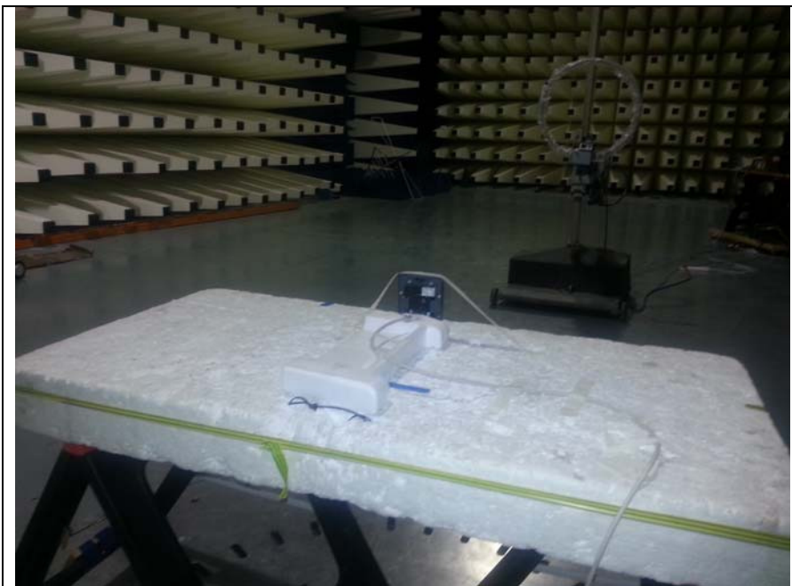
Fig 4 Test setup Rad Emission