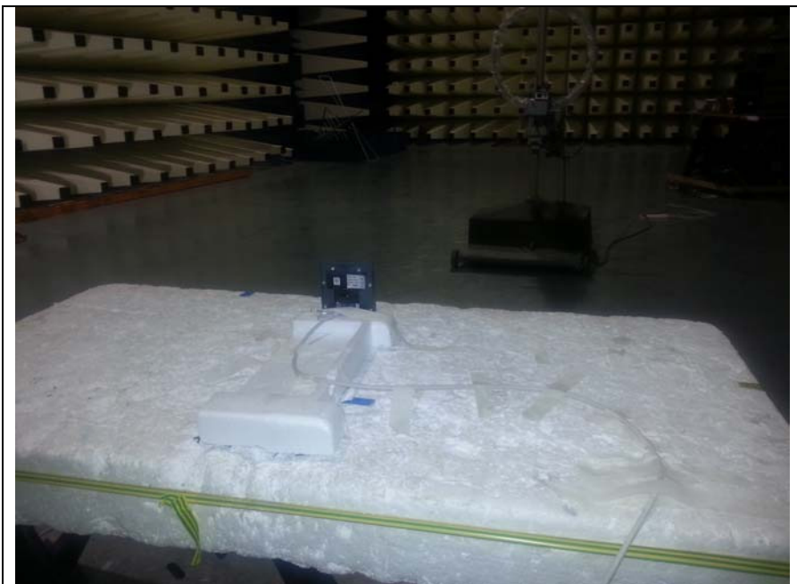
Fig 4 Test setup Rad Emission