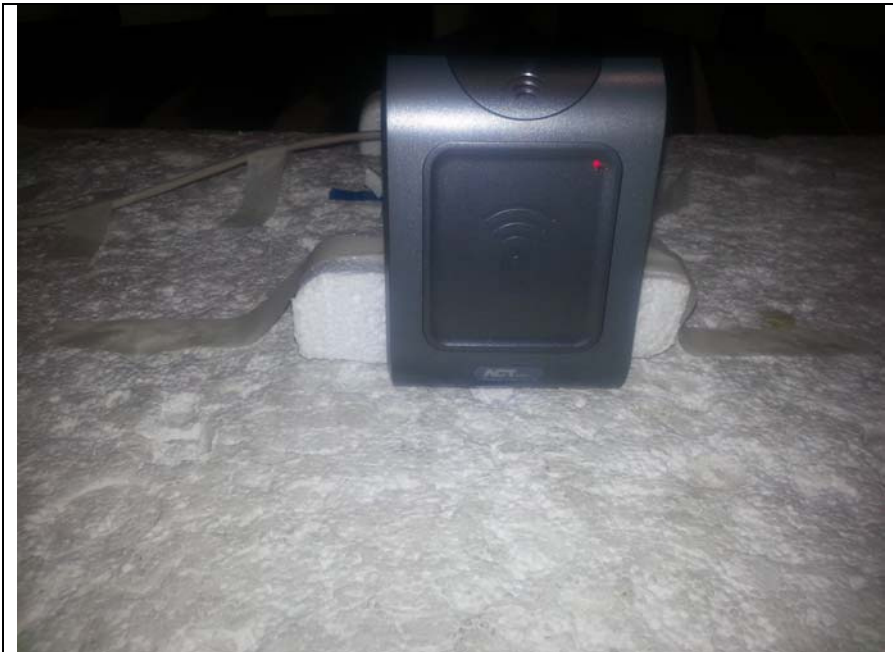
Fig 3 Test setup Rad Emission