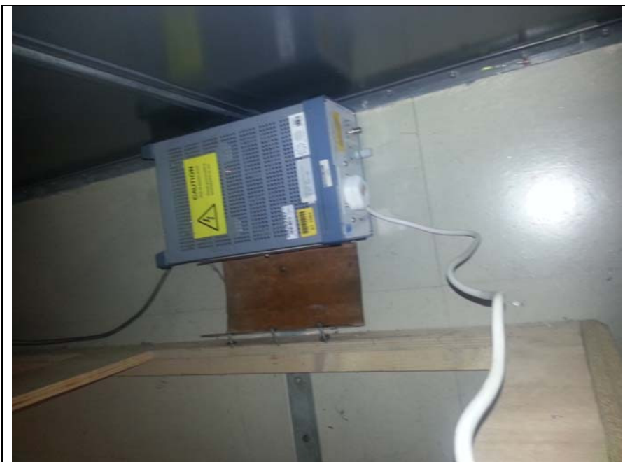
Fig 6 Conducted Emissions on the mains