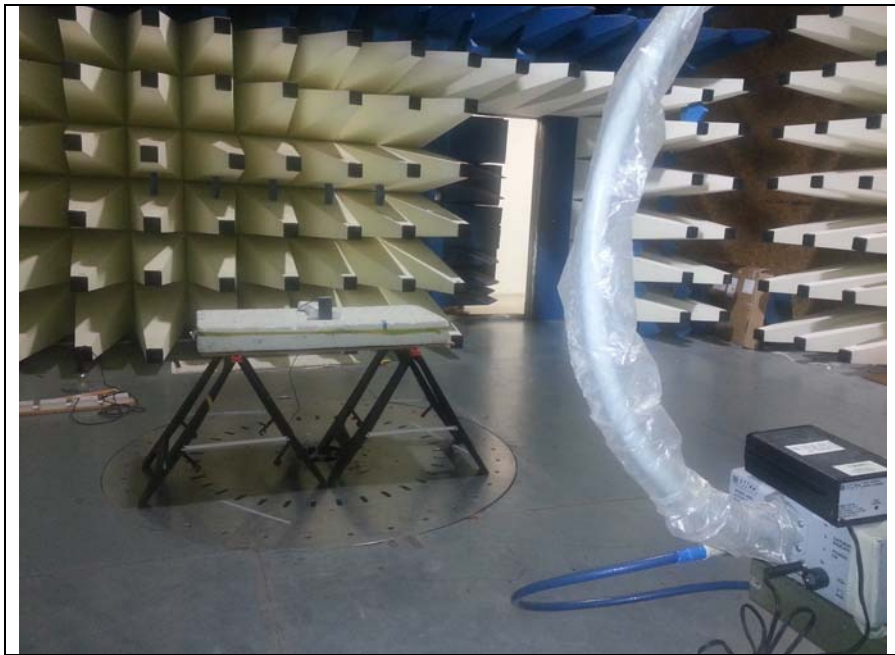
Fig 1 Test setup Rad Emissions