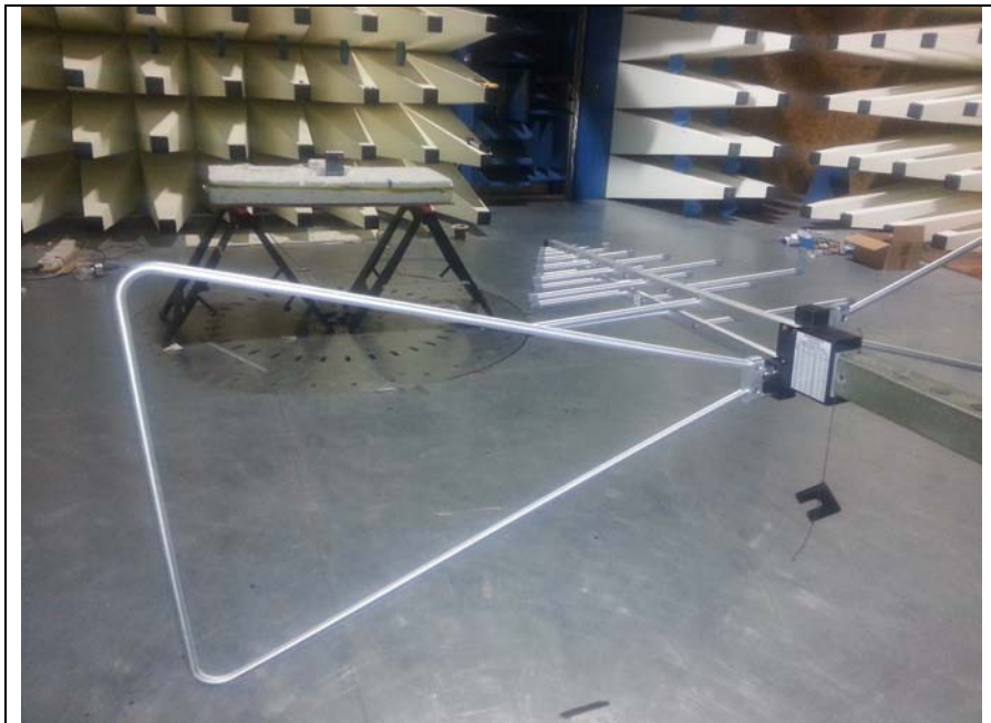
Fig 2 Test setup Rad Emissions