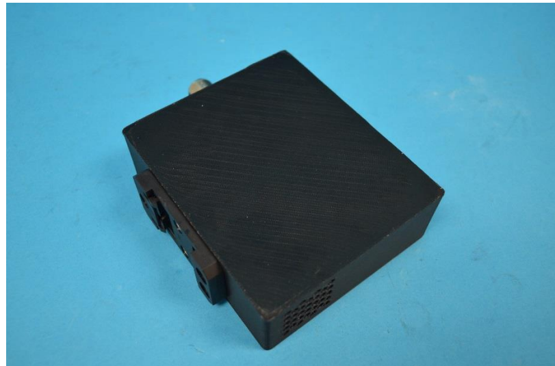
Equipment Under Test