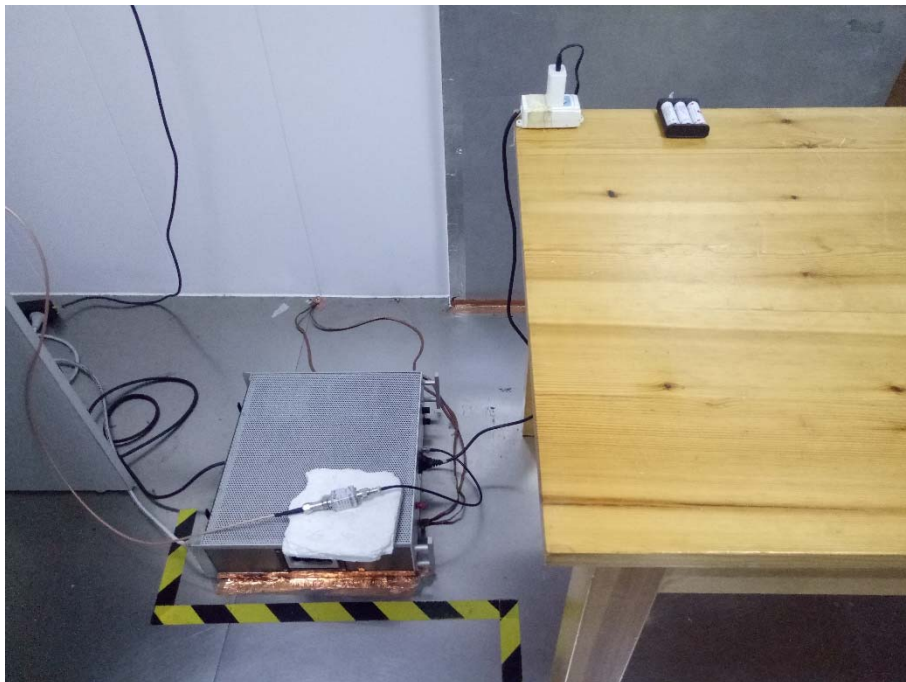
Test Photo 1