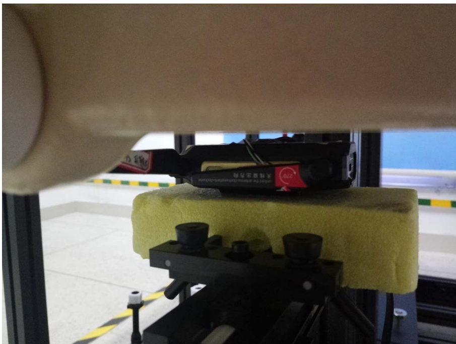
Face side open 90 degrees (ANT B)