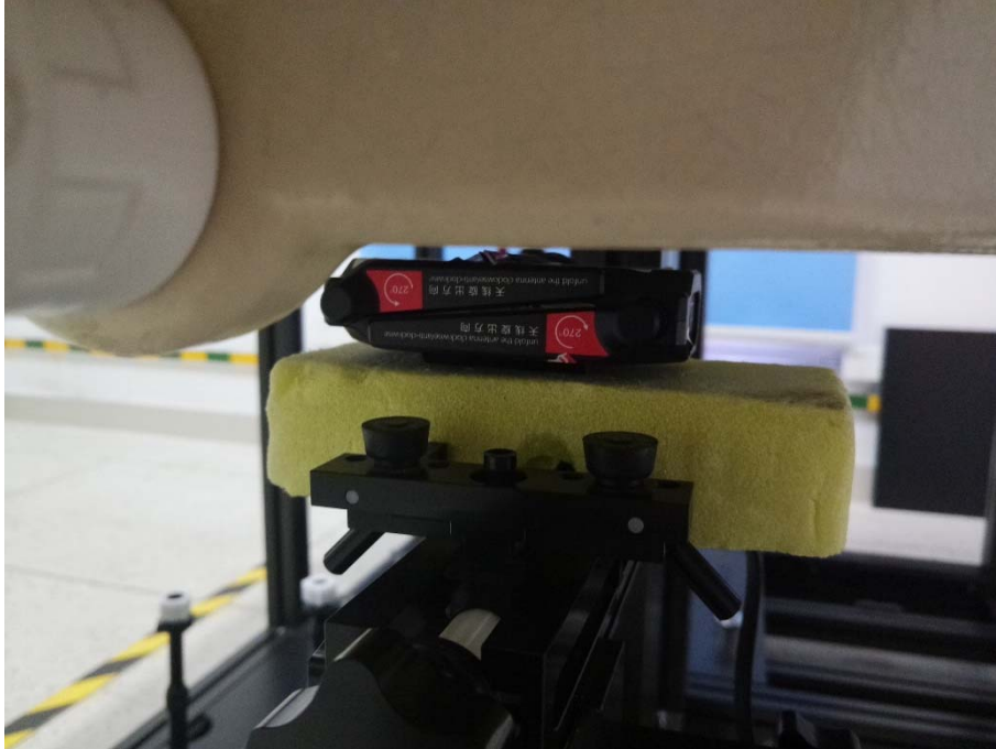
Face side close 0 degrees (ANT A)