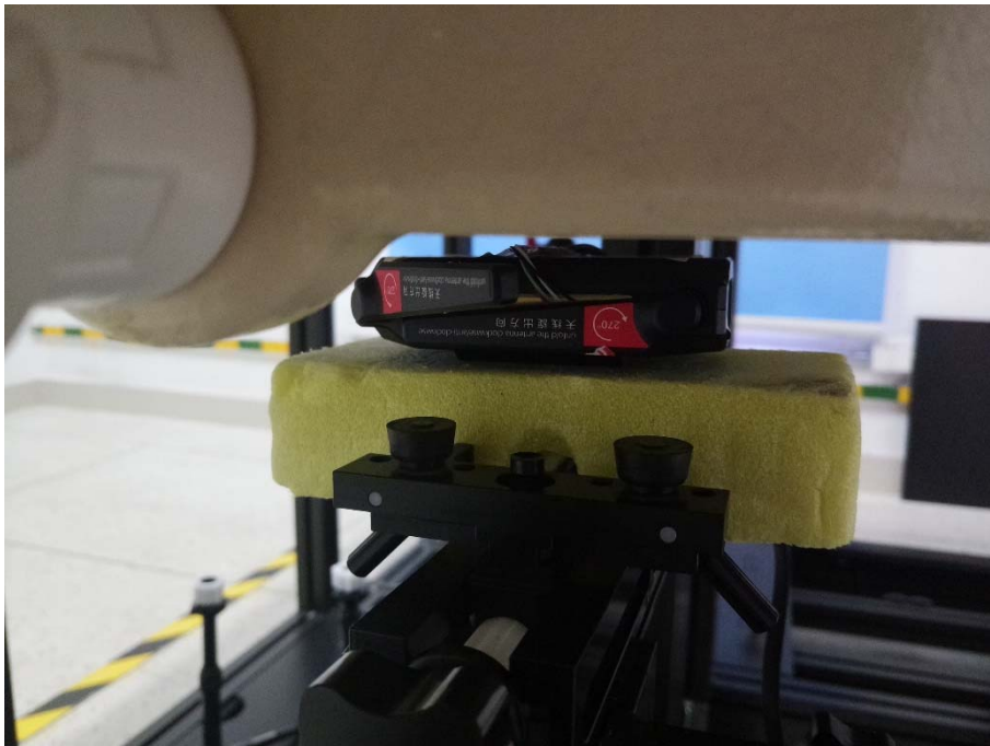
Face side open 45 degrees (ANT B)