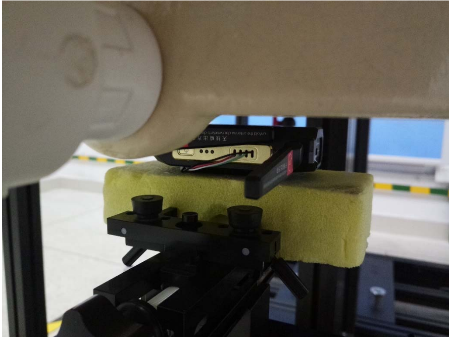
Face side open 90 degrees (ANT A)