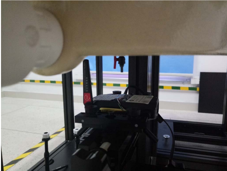
Face side close 90 degrees (ANT B)