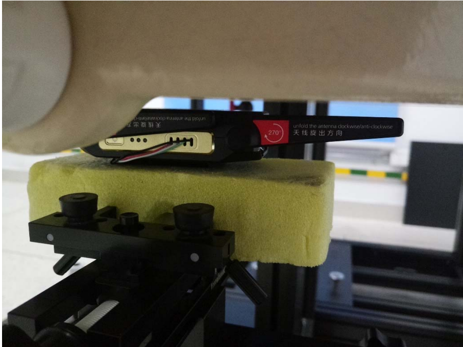
Face side close 180 degrees (ANT A)