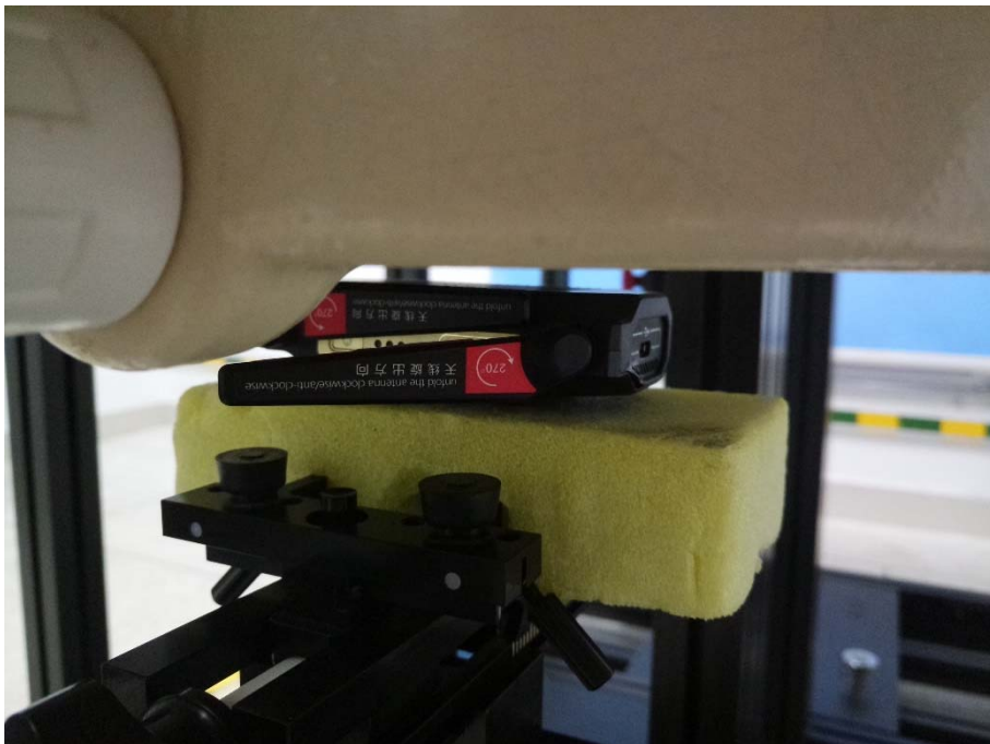
Face side open 45 degrees (ANT A)