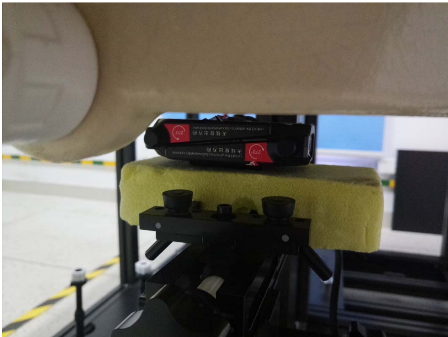
Face side close 0 degrees (ANT B)