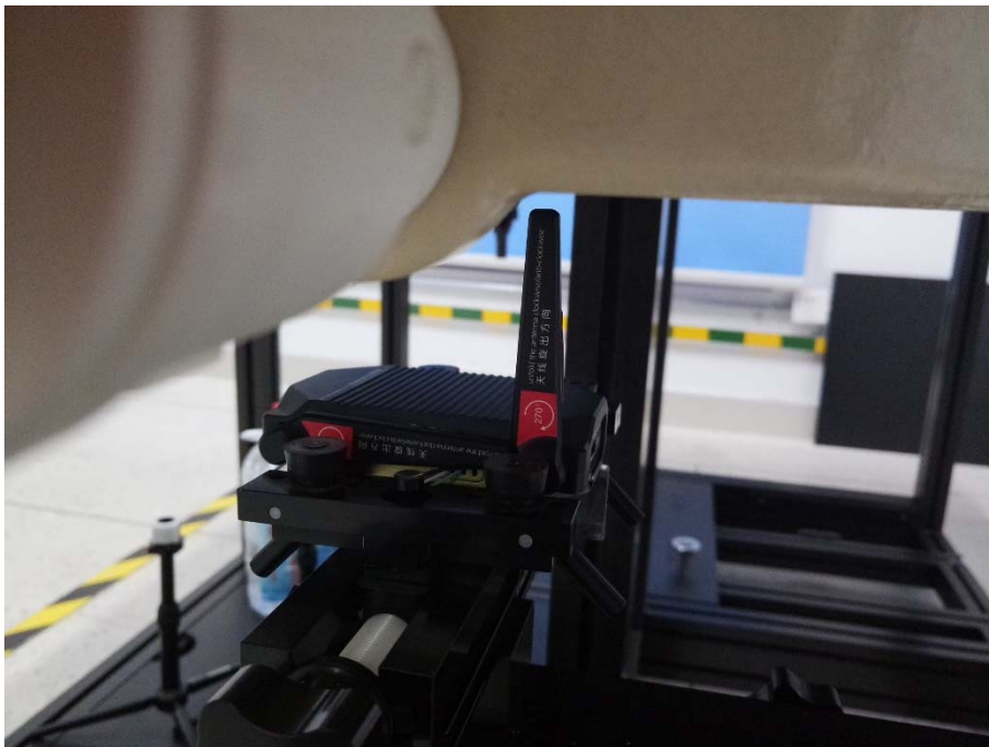
Face side close 90 degrees (ANT A)