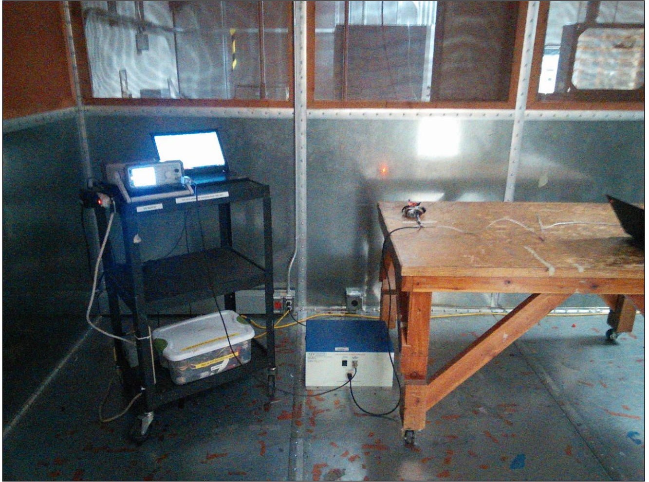
Photograph 1. Conducted Emissions, 15.207(a), Test Setup