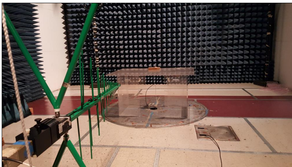
Photograph 2. Radiated Spurious Emissions, Test Setup (1)