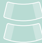
2 Size Panels