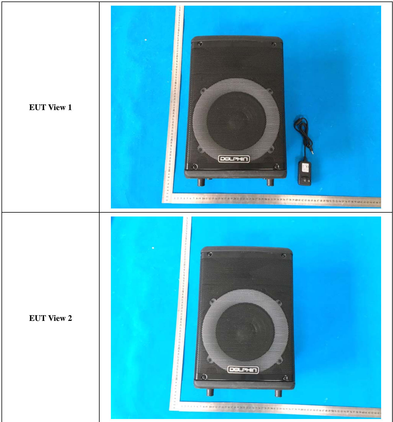
EXHIBIT 2 - EUT EXTERNAL PHOTOGRAPHS