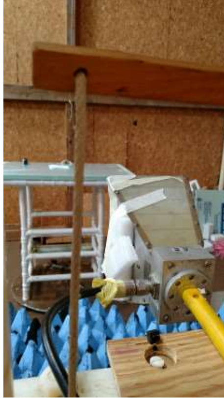
Flat Orientation Setup Above 1 GHz