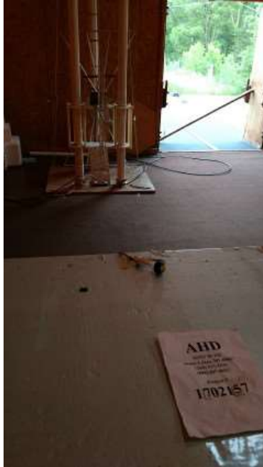
Rear Radiated Setup Below 1 GHz