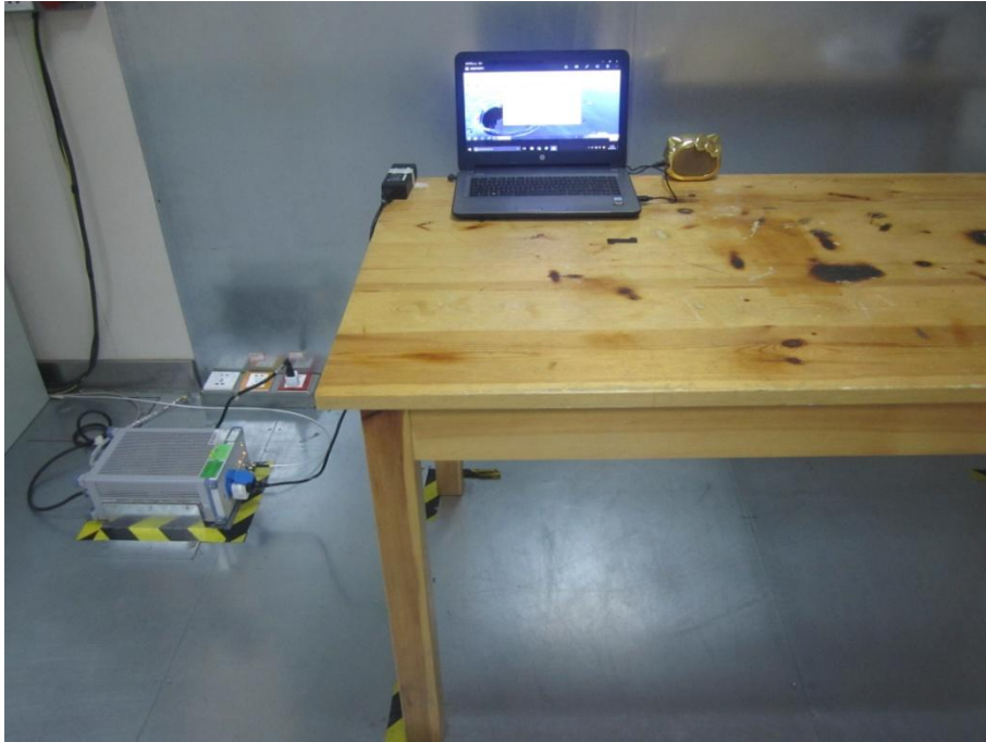
DSS radiation L