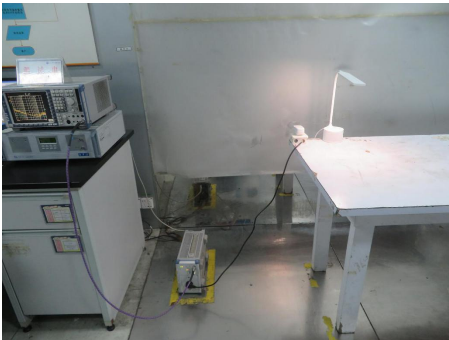
Conducted Emissions Test Setup