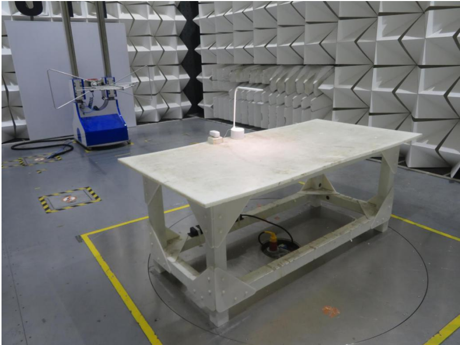
Radiated spurious emission Test Setup-2(30MHz-1GHz)