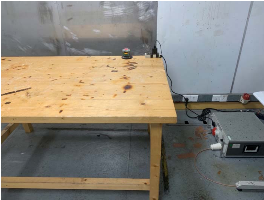
2. Photo of Radiated Emission Measurement Below 30MHz