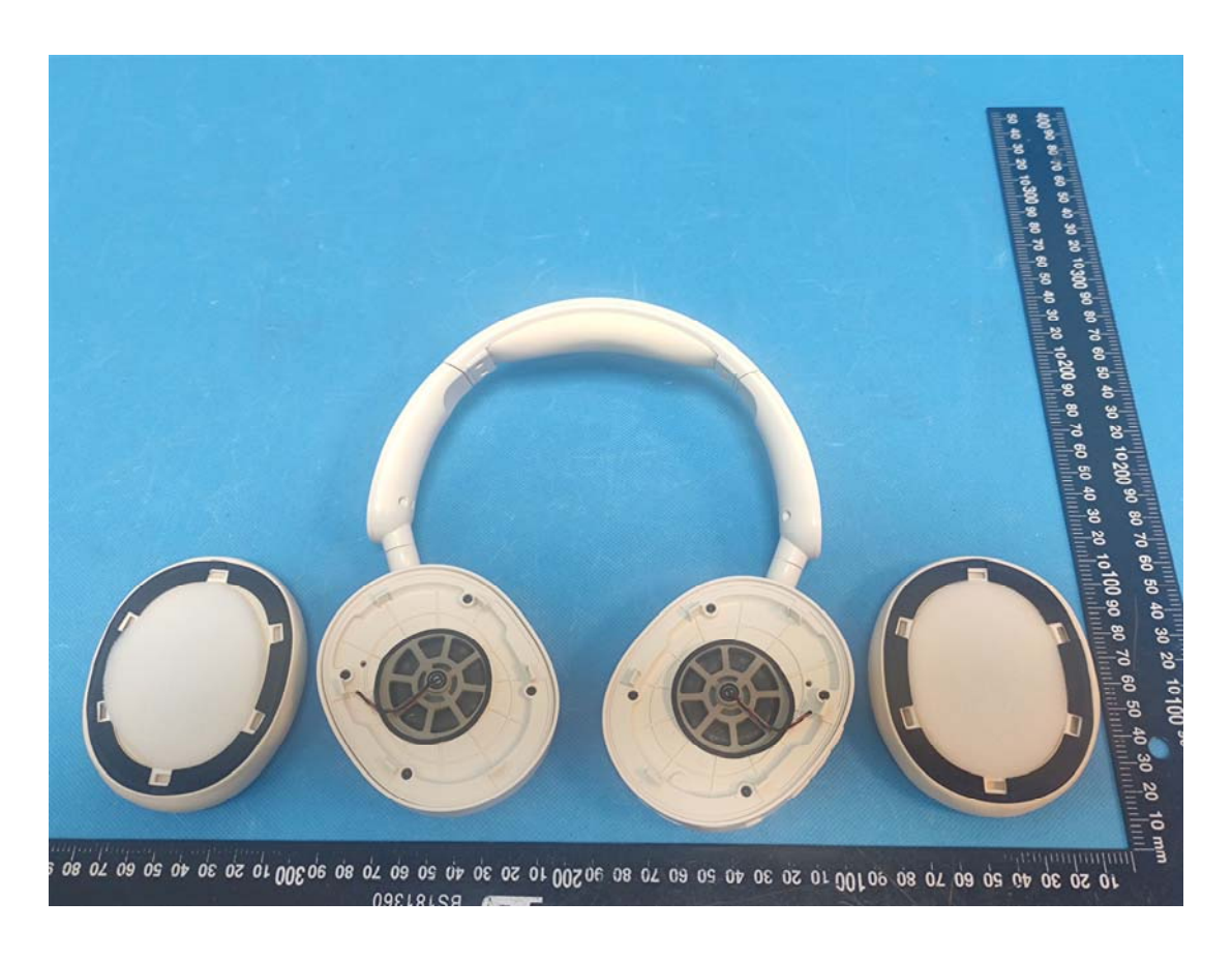
EXHIBIT C - EUT INTERNAL PHOTOGRAPHS