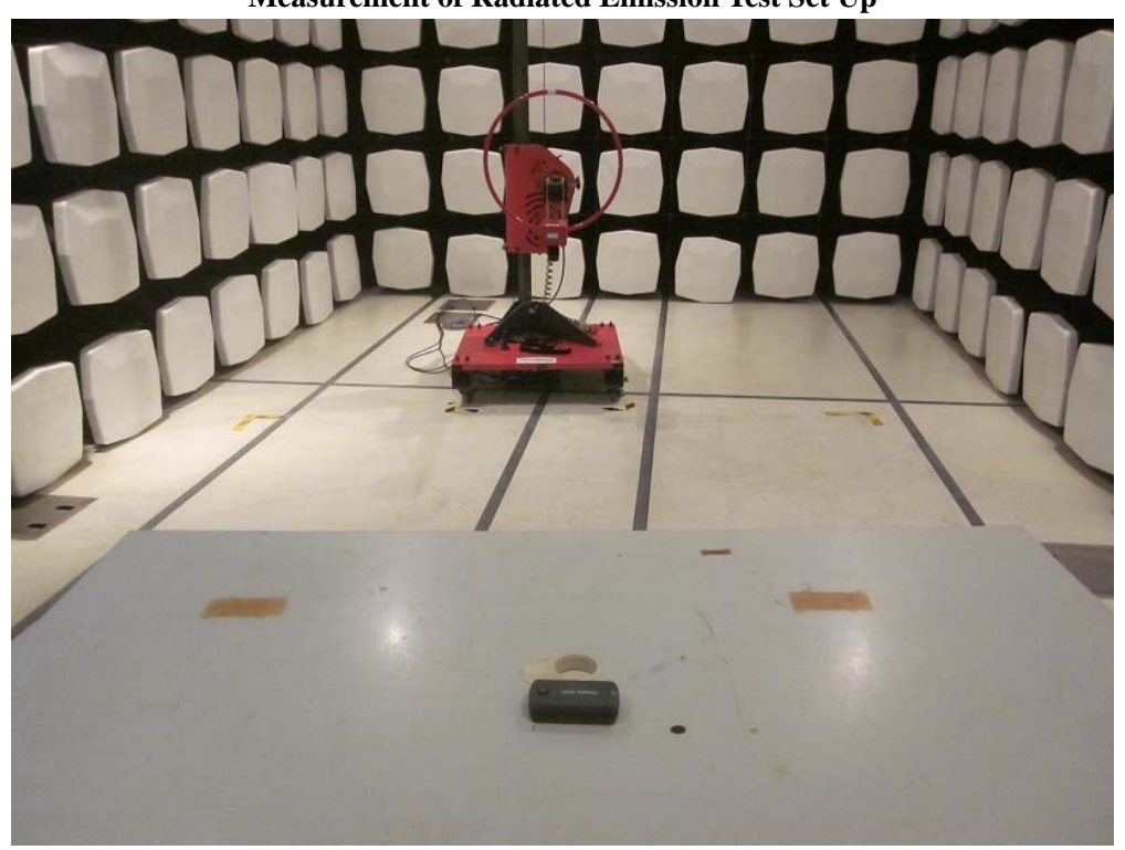
Measurement of Radiated Emission Test Set Up