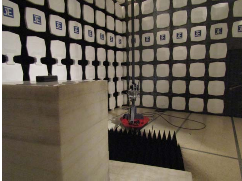
Measurement of Radiated Emission Test Set Up (Above 1000MHz)

Test Photo FCC ID:2AI67-SR ISED:22116-SR