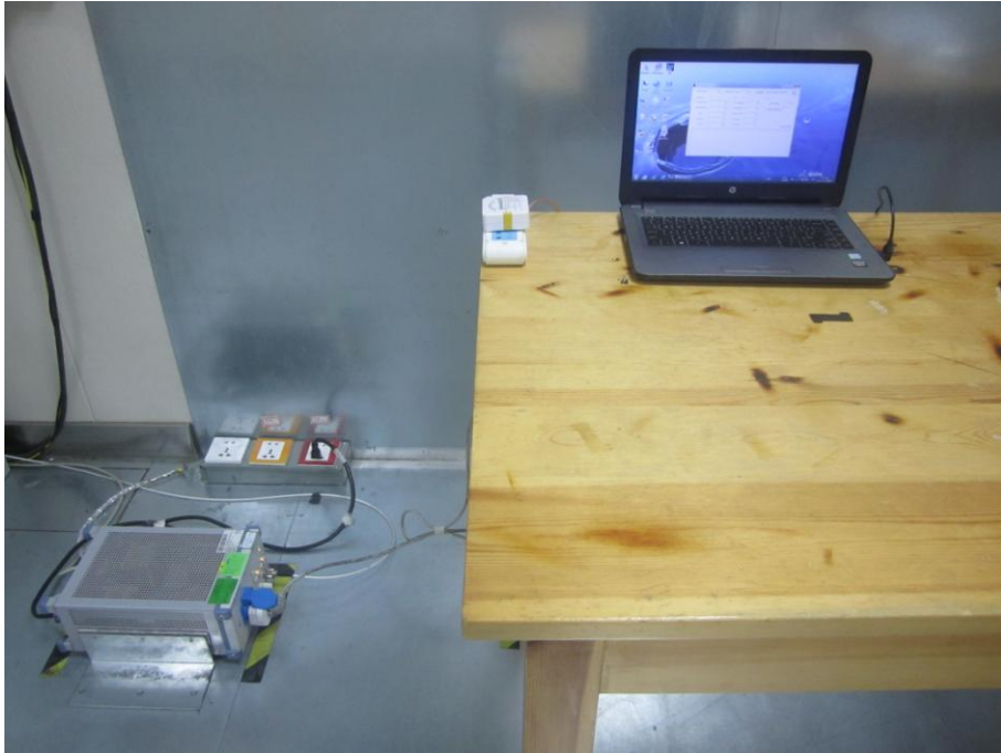
DTS radiation L