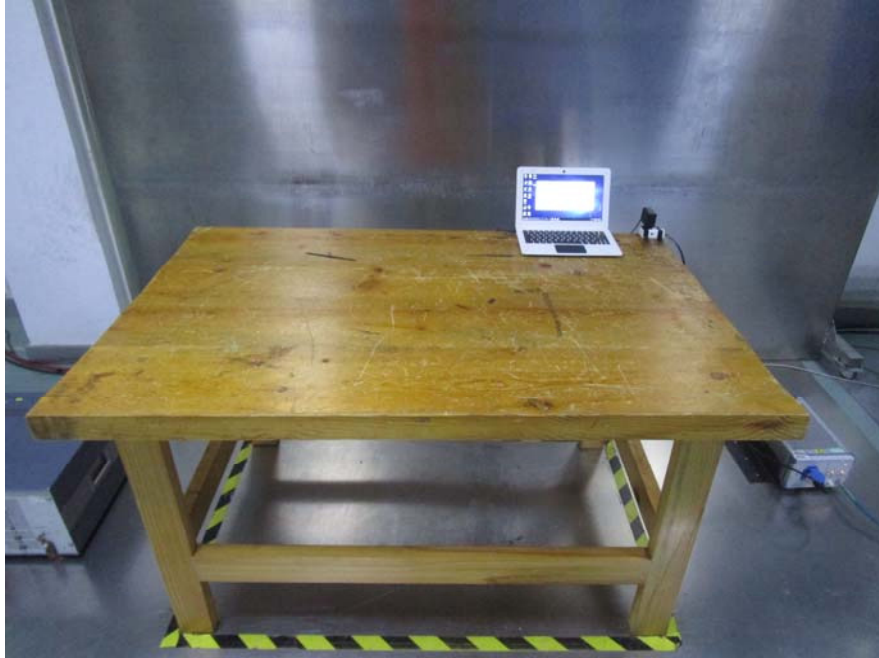
Conducted Emissions - Side View (Adapter #1)