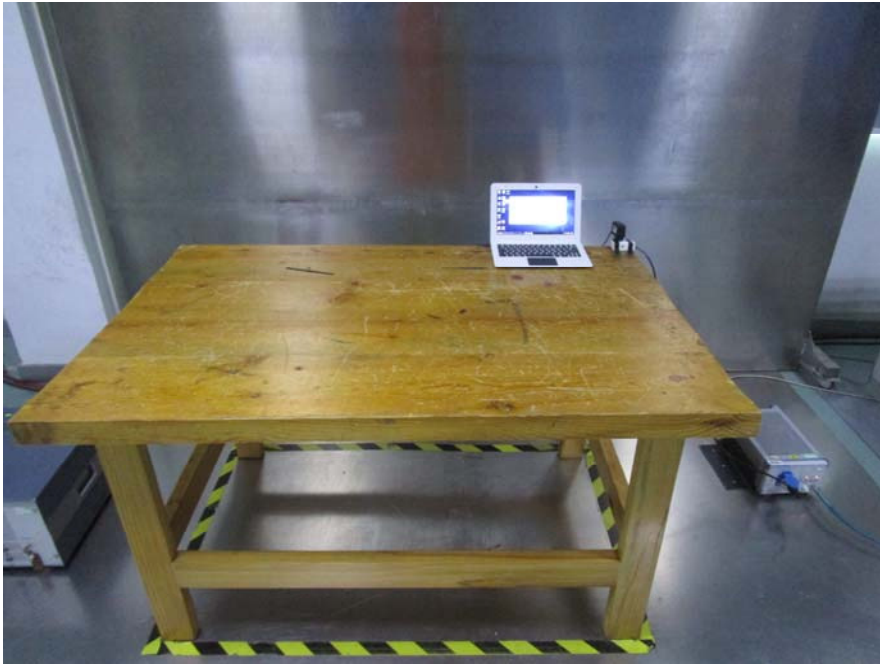
Conducted Emissions - Side View (Adapter #2)