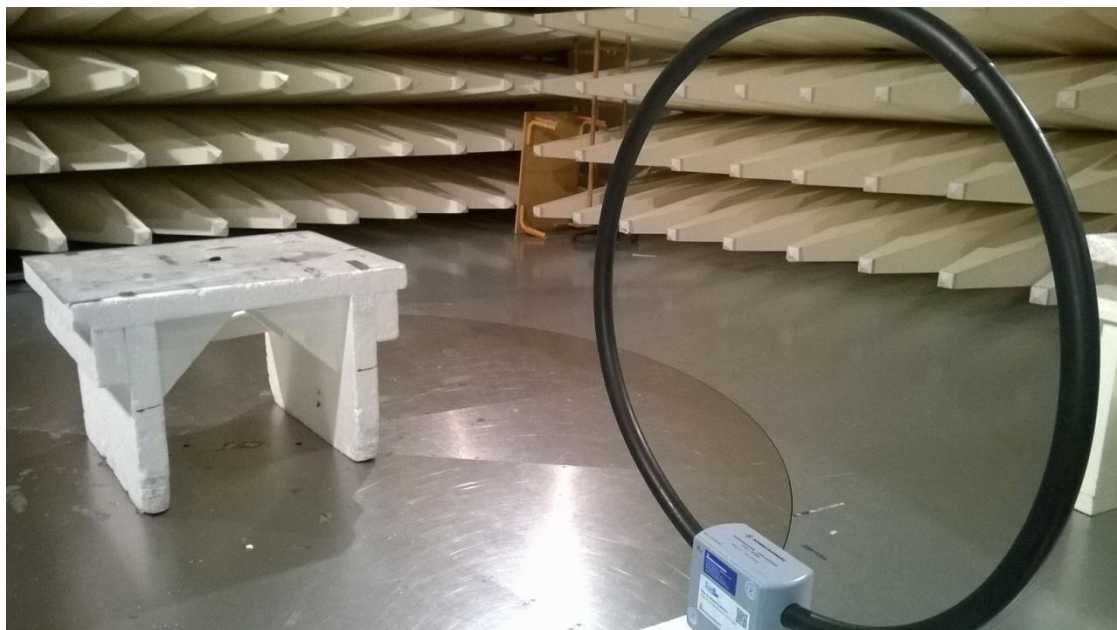
Photograph 1. Radiated emission 0.030 MHz to 30 MHz.