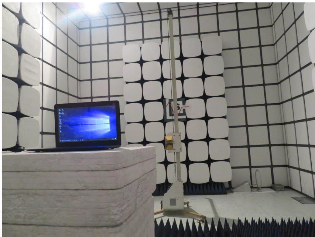
Radiated emission above 1GHz