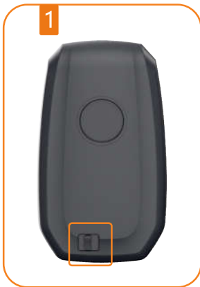
Push the slide button to separate the shell

First use or when the battery runs out need to change new battery, following steps: