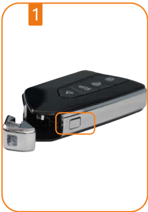
Press the back side button for loose the mechanical key holder

First use or when the battery runs out need to change new battery, following steps: