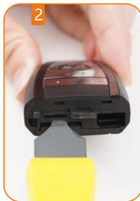
2 Use the tool into the gap to separate the shell