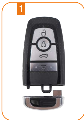
1 Press the back side button for loose the mechanical key holder

First use or when the battery runs out need to change new battery, following steps: