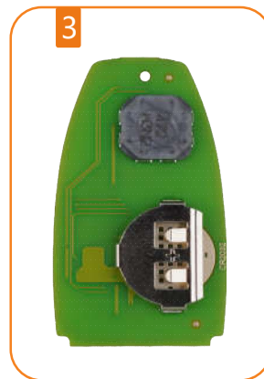
3 Take the battery out and replace new one