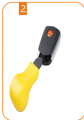
2 Use the tool into the gap to separate the shell