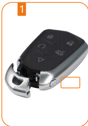
1 Press the back side button for loose the mechanical key holder

First use or when the battery runs out need to change new battery, following steps: